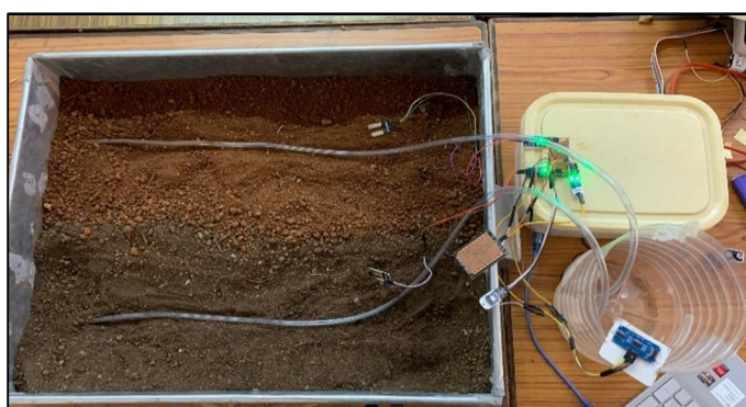
Fig 2. Farm prototype