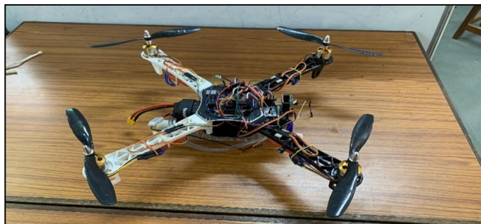
Fig 3. Agricultural Drone