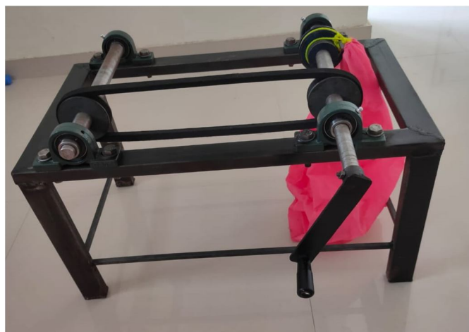
Fig6. Final Prototype Model