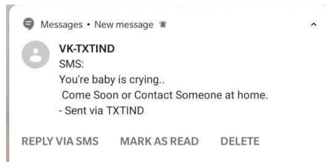
Fig.4 Received SMS