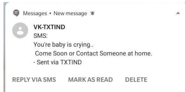
Fig.4 Received SMS