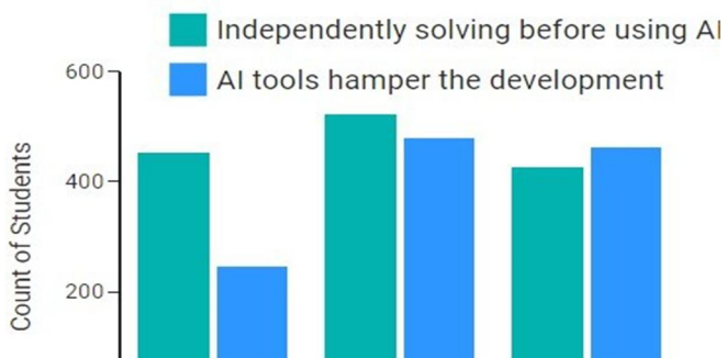
Error! No text of specified style in document. Figure 3: Students Skills and needs of AI tools.

In our think about, we utilized the K-means clustering calculation to analyze study information related to students' certainty levels in fathoming IT issues without the help of AI devices. We clustered respondents based on their self-reported certainty levels, extending from "Not certain at all" to "Amazingly sure." By applying K-means clustering to this information, we gotten a histogram that outlines the conveyance of understudies over diverse certainty levels. This histogram gives bits of knowledge into the in general certainty levels of understudies in their problem-solving capacities without depending on AI instruments. Besides, we analyzed the recurrence of information focuses inside each cluster to observe designs with respect to students' autonomous problem-solving approaches.