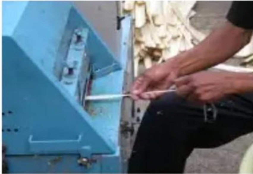
Figure - Motor-driven machine

Historically, banana fiber was extraction by hand. The process requires a long period of time and skilled practice to collect fibers. This research employed an invented motor-driven machine as extraction tool.