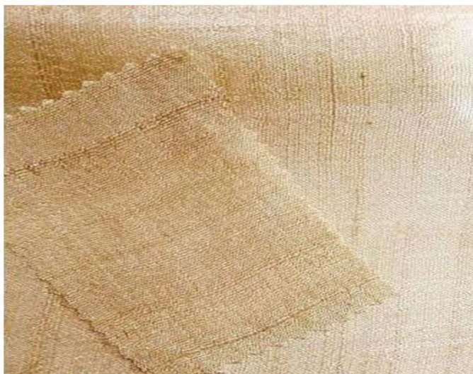
Figure - Banana fiber knitted trial