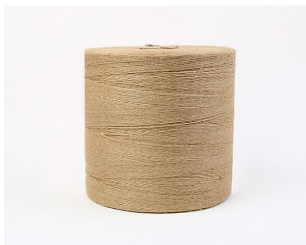
Figure - Banana spun yarn