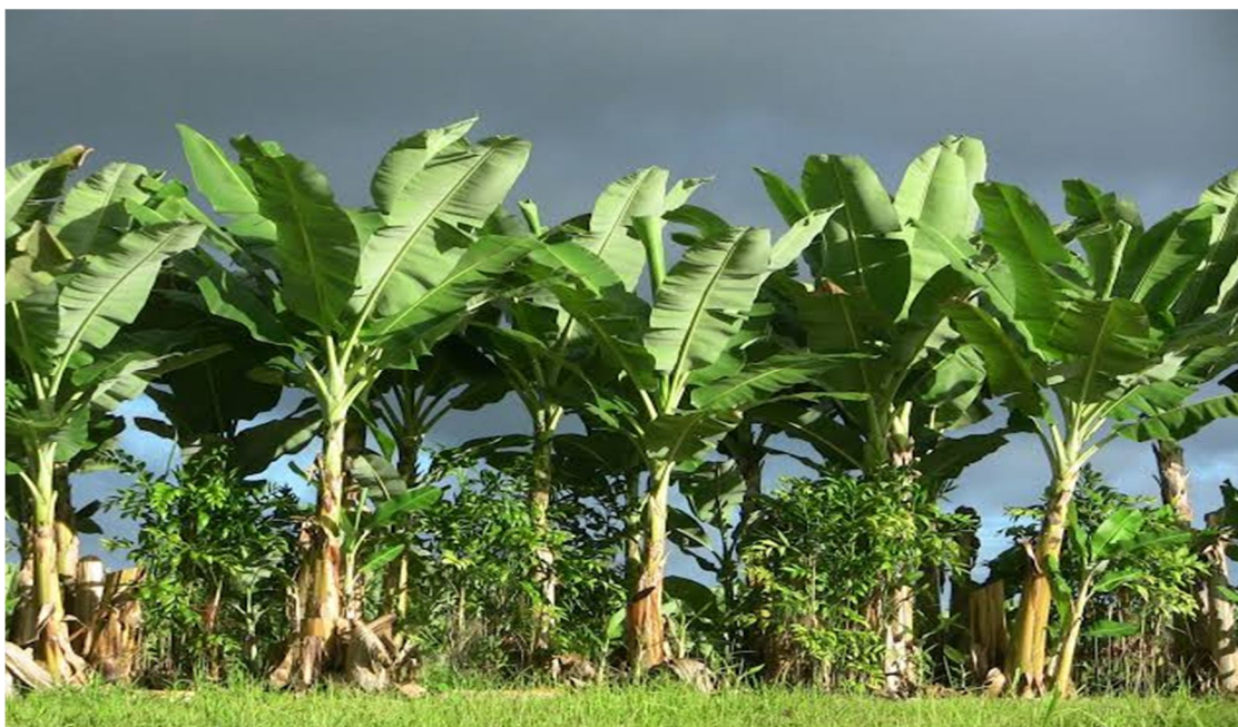
Figure - Indigenous banana plant in India