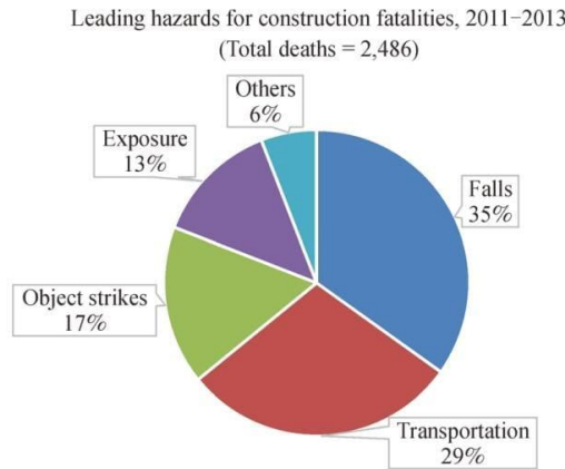
Fig. 2 Distribution of leading hazards that causes construction Fatalities.[2]