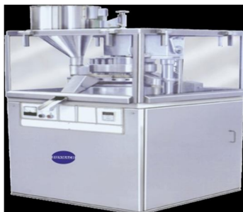
Figure 2: pressing a tablet with one side

A press with a single side and a doublet feeder with two chambers that are separated from one another is the most basic design. With different strengths, each chamber is force-fed or gravity-fed to produce two distinct tablet layers. The die is filled with the first and second layers of powder as it passes under the feeder. The pill is then compacted in a single or double process.(20 and 21).