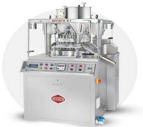
Figure 3: tablet press with two sides

Tablet weight is tracked and managed by compression force in the majority of double-sided tablet presses with automated production control. The control system measures the effective peak compression force at the major compression of each tablet or layer. When adjusting the die fill depth, the control system uses this recorded peak compression force as a signal to reject tablets that are not up to grade (23–24).