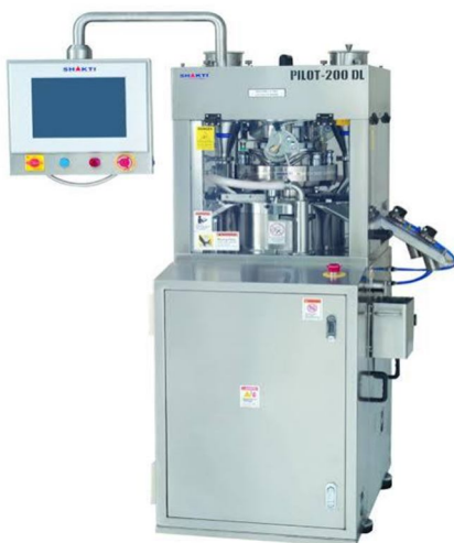
Figure 4: pressing a two-layer tablet while tracking displacement

There are significant differences between the compressions force-based approach and the displacement pill weight management principle. The applied force before compression determines the control system's sensitivity when sensing displacement rather than the tablet weight. (25, 26; 27)