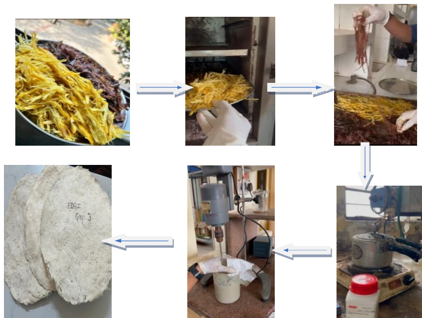
Fig : Graphical Presentation of each step