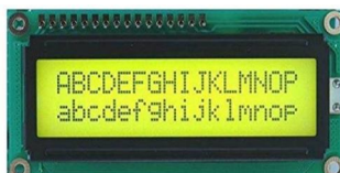
16*2 LCD Display

An LCD is an electronic display module that uses liquid crystal to produce a visible image. The 16x2 LCD display is a very basic module commonly used in DIYs and circuits. The 16x2 translates a display 16 characters per line in 2 such lines. In this LCD each character is displayed in a 5x7-pixel matrix.