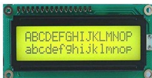
16*2 LCD Display

An LCD is an electronic display module that uses liquid crystal to produce a visible image. The 16x2 LCD display is a very basic module commonly used in DIYs and circuits. The 16x2 translates a display 16 characters per line in 2 such lines. In this LCD each character is displayed in a 5x7-pixel matrix.