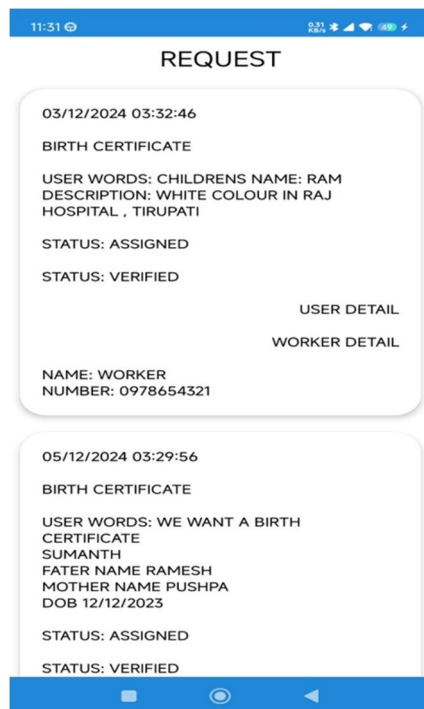
Fig. 3. Admin task assigning page