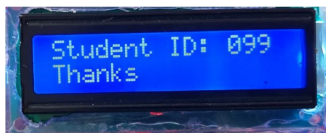
Fig. 4. Displaying student details