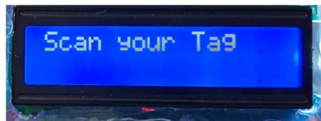
Fig. 1. Initial Display

In this expanded content, a SheetHandler class is introduced to handle operations related to Sheet1 and Sheet2. The decrease_counter_value method is defined to decrease the counter value for a given primary value in Sheet2. The get_sheet_data method serves as a helper function to retrieve data from Sheet1, while the read_sheet_data method reads data from Sheet2. These functions collectively provide a structured approach to manage and manipulate data from the specified sheets, enhancing the functionality of the program.