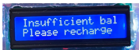
Fig. 5. When there is no recharge in card