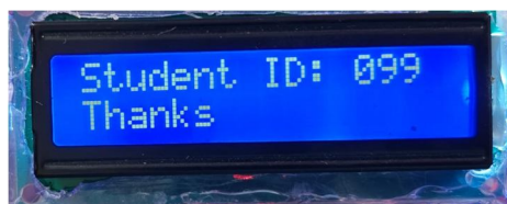
Fig. 4. Displaying student details