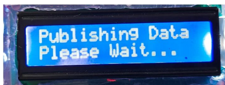
Fig. 3. validating