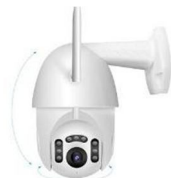
Fig. f) 360° Wireless Camera