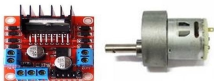
Fig c) Motor, Motor Driver