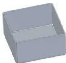
Fig d) Thin Steel Box

Thin steel box is used to make faces of the smart scarecrow.