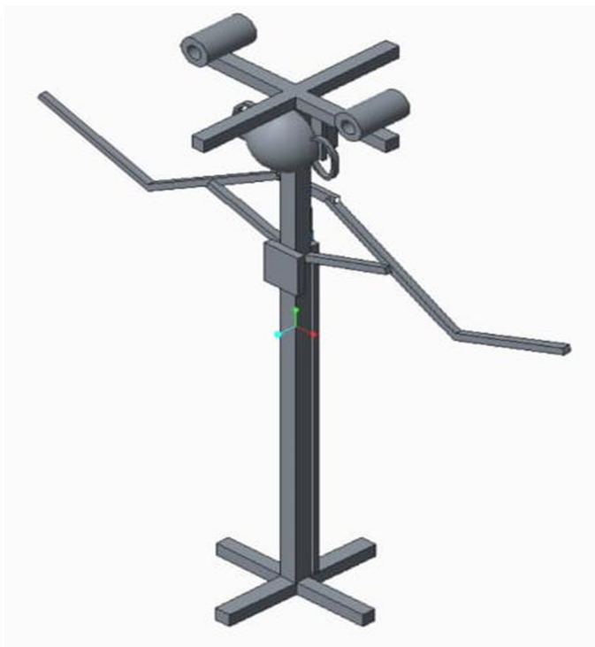
d) Isometric View