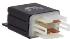
Fig a) Relay