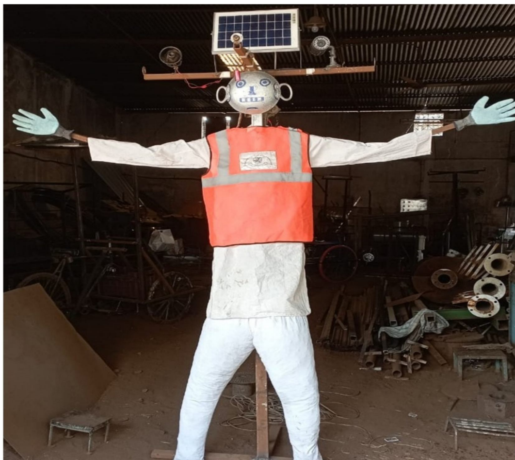
Fig. Actual of Scarecrow