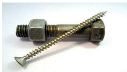
Fig c) Nuts, bolts & screws

Nut and bolts, Screws are used to joint the components into the structure and mechanism, Nut and bolts are used for temporary joint in the flapping mechanism to easily flap the smart scarecrow arms upward and downwards. Screws are used for permanent joint of the structure and the mechanism