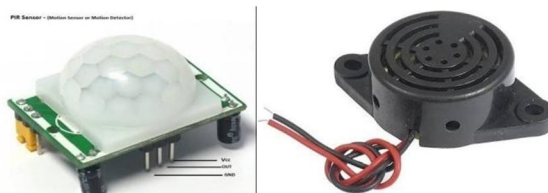
Fig d) IR Sensor, Buzzer