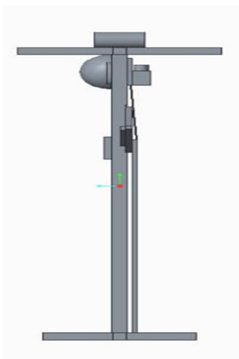
c) Side View