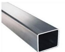
Fig a) Metal Pipes

We have used square hollow section mild steel pipe for making Scarecrow's structure. Which provide strength to the structure of scarecrow.