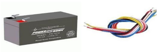
Fig e) Battery and Connecting Rods