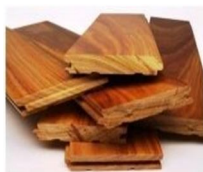
Fig b) Wood

We have used solid wood and ply for making our project's mechanism (Flapping mechanism). Solid wood is used to provide support to the mechanism, and ply is used to make flapping hands, crank and connecting rod.