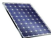
Fig b) Solar Panel