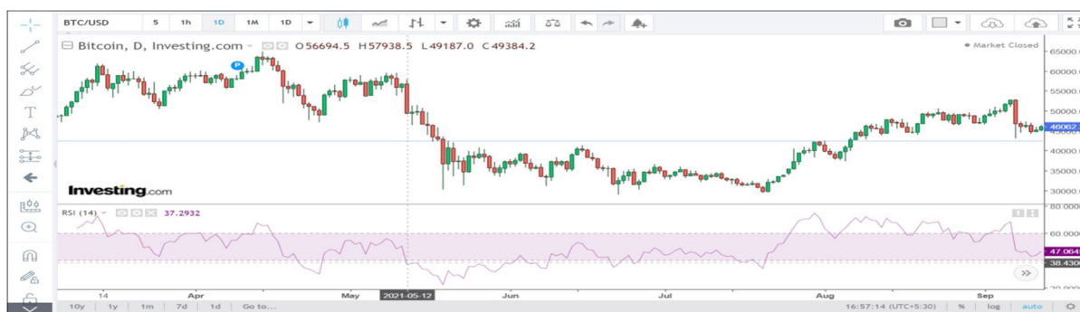
Graph Of RSI When RSI Is Below 40

If we analyze this graph on 12 May 2021 the RSI line went below 40 and after that see how the price of bitcoin dipped. And if someone wants to short position on bitcoin it is the best time to do so because if we analyze the candlesticks also it is a big red candle which is a positive sign for those who want to short and it's a bad signal for those who are holding this stock so now, they have to square off their position.