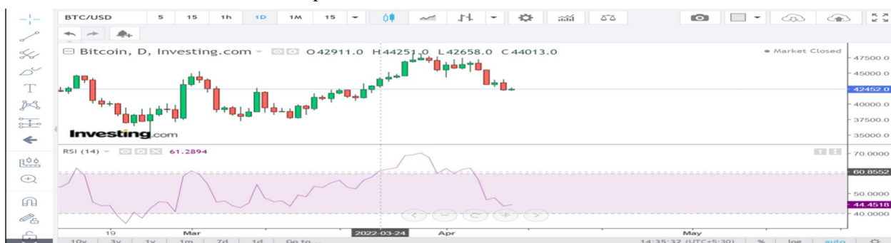
Graph Of Rsi When Rsi Is Above 60

In the above graph on 24 March 2022, the RSI line crosses 60 and if we look at the candlesticks simultaneously Evening Star Candlestick Pattern is formed after crossing 60 see how the prices of Bitcoin became a rocket and in the span of 5 days if someone has taken this trade if that investor had 1 bitcoin, they might end up making $5000-6000 which is an insane amount of profit in such short period. And even if someone wants to hold their position then after that RSI takes the support of 60 two times which is showing bullishness but when it went below 60 a someone who has made enough profit can square or we can hold our position but, in this case, first the shooting star is formed and even evening star is also formed just after 2 days so it is better to book profit at that time. And one can also analyze this position by MACD what it is showing if MACD is also giving signal Sell then we must book our profit in this situation.