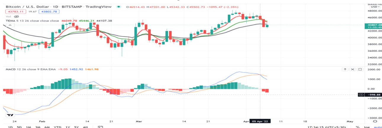
Graph of MACD

And bearish MACD divergence occurs when the price of cryptocurrency is making a higher high which is an uptrend but MACD is making a lower low which is a downtrend. This shows that the buying pressure is decreasing in the market and sellers are entering the market and they are ready for heavy selling which indicates a bearish reversal.