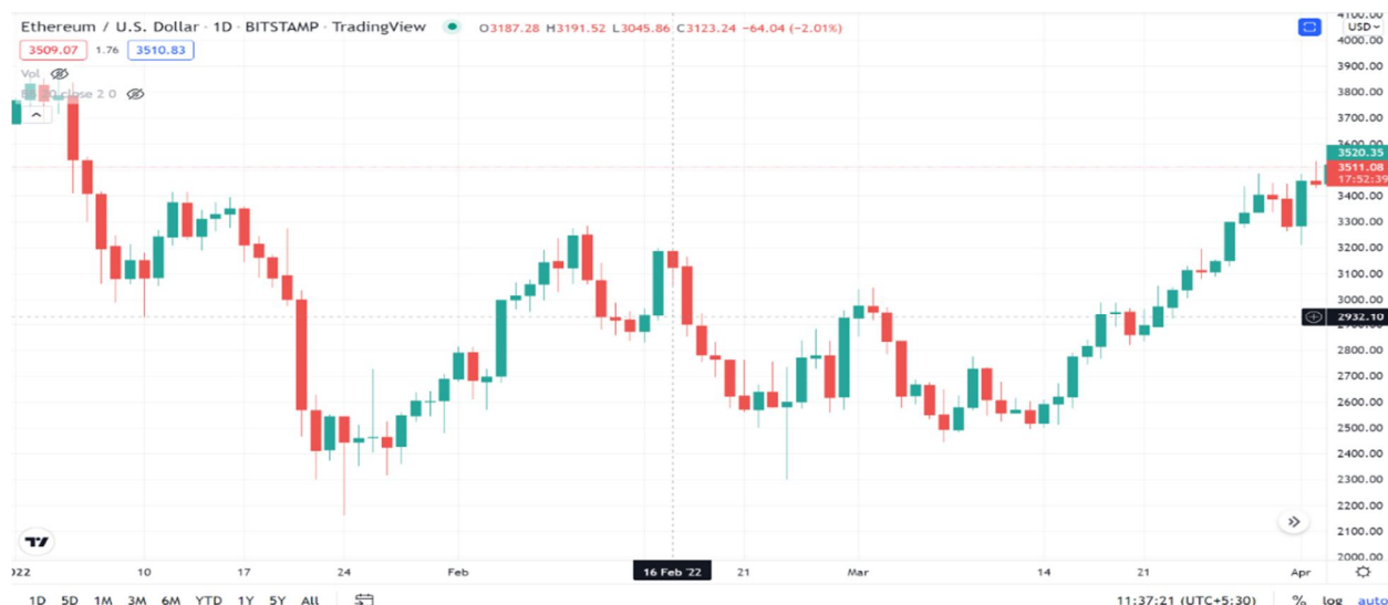
Graph Of Hanging Man Candlestick Pattern