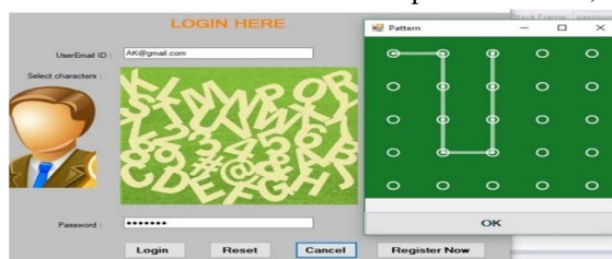
Fig 1. The interface of user authentication of CODP scheme, where English alphabet and digits (0-9) are used as visual objects in CS-AV of the password in a bit is n , and the possible value is 2^n . e.g.,

where, P(X=x) is the probability that the variable X has the value of x . The entropy is used to determine the difficulty of the password or key [20]. It can be conventionally expressed in bits. If i bits are chosen and 2^i are possible values and it is said to have i bits of entropy. If n numbers of characters are chosen from the size of N alphabets in total, then the entropy