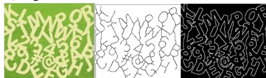
(a) Original image (b) Skeleton image (c) Edge detection

There is no comprehensive segmentation solution that can be applied to segment and recognize the individual object on Captcha image with a 100% success rate to date [25]. Fig. 3