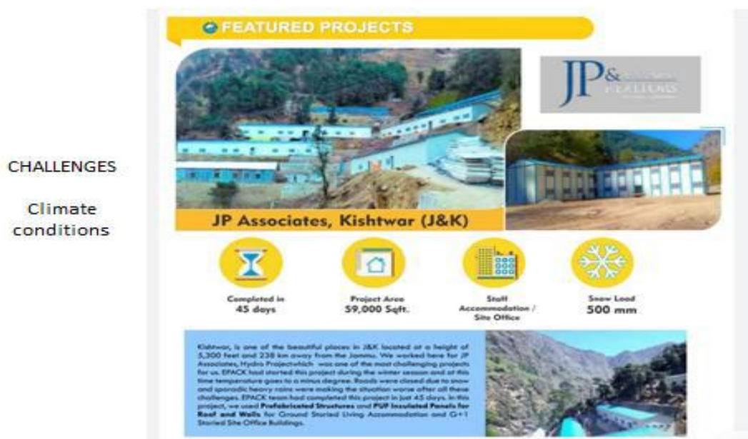
Fig.1 Featured Projects

EPACK, which was founded in 1999, has grown to become one of the fastest-growing infrastructure companies, specialising in the development of sustainable and solutions for smart building. In the previous 20 years, our products have served a wide range of sectors as well as several major government projects in India, as well as being sold overseas.