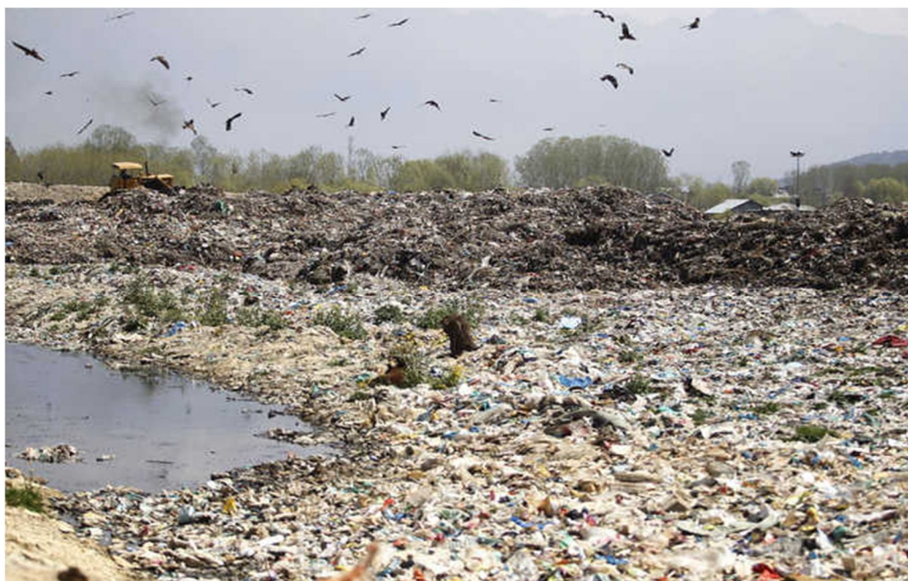
Fig 3: Improper land Filling of waste at Achan dump site