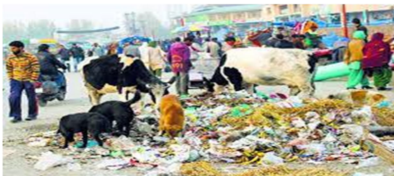
Fig 2: Open Waste Collection Point