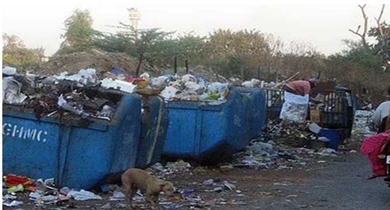
Fig 1: Dumper Bins