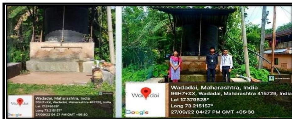
Fig. 3 Water Source Velneshwar

We conducted a survey in Velneshwar village, we observed that there is no main water source in the village but there are public and private water sources for each wadi and the houses in each wadi are supplied water from the same private and public source. Since direct water supply from the source and there is no storage tank, water scarcity remains. During the medical survey, the doctor informed that 60% to 70% of the diseases are due to poor water quality in Velneshwar village. The peoples in Velneshwar daily using the water for drinking and other purpose. So due to this they are facing much more problem below are the figures and table of sources and location latitude, longitude in Velneshwar village are respectively.