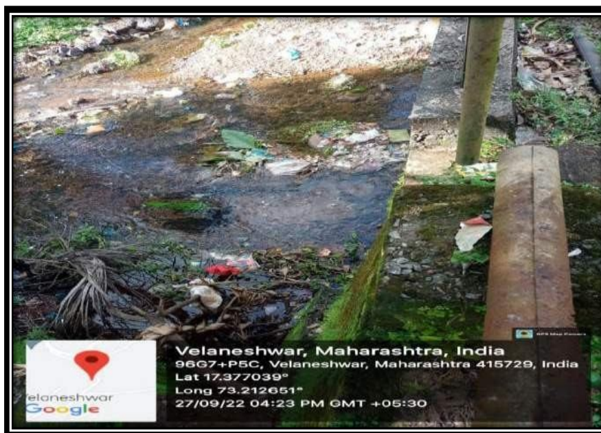
Fig. 4 waste Water management Velneshwar

At the selected site there is no any proper waste and sewage management. The local people throw the garbage into the nearest natural vessel (small river). The source of natural water is polluted. The polluted river is shown following fig.