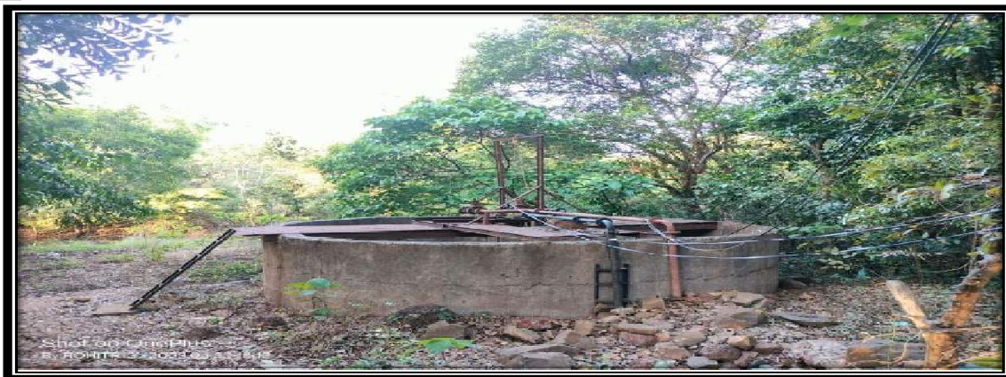
Fig 5 Water source for WTP