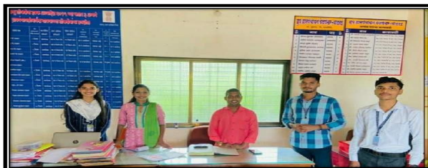
Fig 1. Group Gram Panchayat Velneshwar

The total geographical area of village is 847.99 hectares. There are about 727 houses in Velneshwar Village. As per 2019 statistics, Velneshwar village comes under Guhagar Assembly Constituency and Raigad Lok Sabha Constituency. Chiplun is the nearest town to Velneshwar for all major economic activities, which is approximately 45 km away.