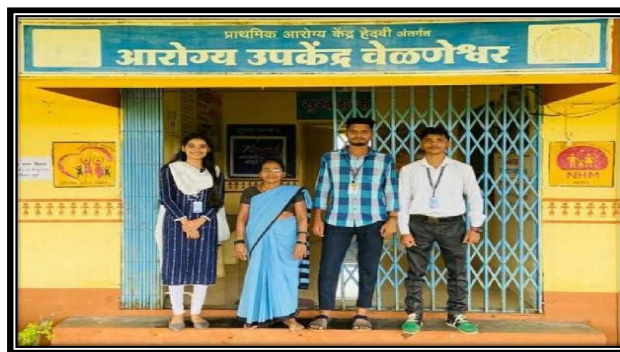
Fig. 2 Health Sub centre Velneshwar