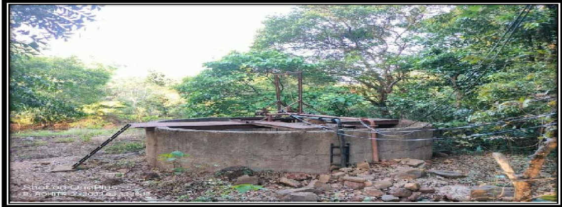
Fig 5 Water source for WTP