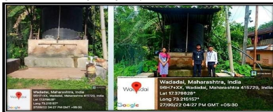
Fig. 3 Water Source Velneshwar

We conducted a survey in Velneshwar village, we observed that there is no main water source in the village but there are public and private water sources for each wadi and the houses in each wadi are supplied water from the same private and public source. Since direct water supply from the source and there is no storage tank, water scarcity remains. During the medical survey, the doctor informed that 60% to 70% of the diseases are due to poor water quality in Velneshwar village. The peoples in Velneshwar daily using the water for drinking and other purpose. So due to this they are facing much more problem below are the figures and table of sources and location latitude, longitude in Velneshwar village are respectively.