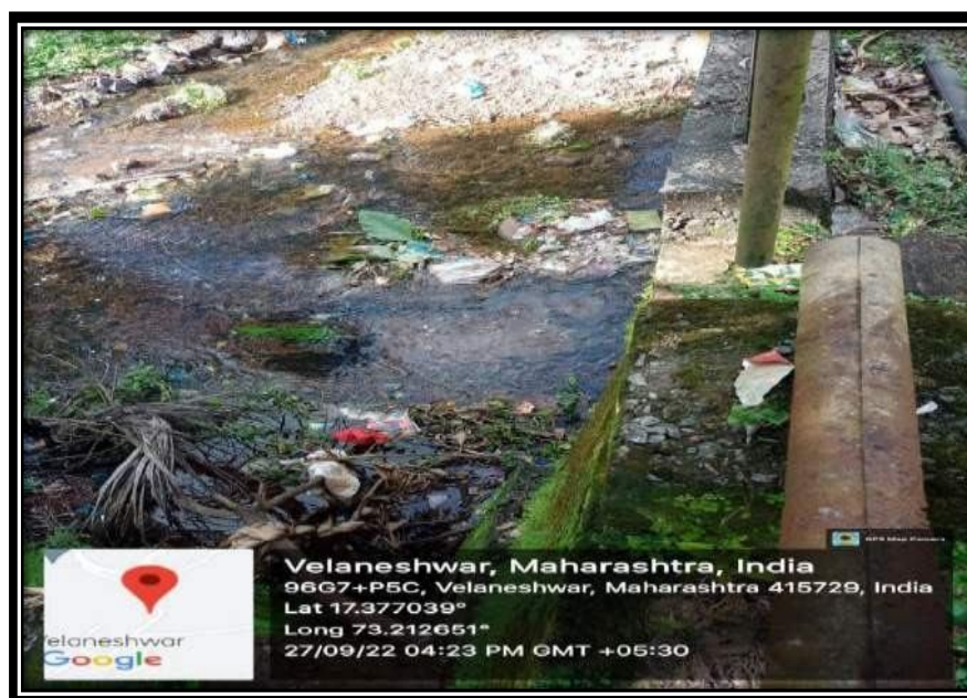
Fig. 4 waste Water management Velneshwar

At the selected site there is no any proper waste and sewage management. The local people throw the garbage into the nearest natural vessel (small river). The source of natural water is polluted. The polluted river is shown following fig.