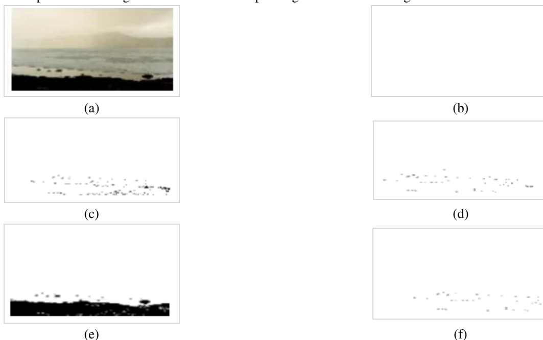
Figure 1: Fine Gaussian SVM predictions for a landscape image (a) Original image (b) Ground truth (c) Prediction by RGB features (d) Prediction by HSV features (e) Prediction by YCbCr features (f) Prediction by RGB-YHS features

As shown in Table 1, Schmugge skin image data set contains 33,693,901 number of pixels, where 8,281,509 of them are skin pixels and 25,412,392 of them are nonskin pixels. Due to these numbers, it can be said that 24.58% of pixels belong to skin and 75.42% of pixels belong to nonskin regions, which means that the skin class (positive class) is minority class and nonskin class (negative class) is majority class. These ratios cause unbalanced classification problem. In this study, the unbalanced classification problem is solved by training the fine gaussian SVM with equal number of randomly selected skin and nonskin pixels. 16564 random pixels whose 8282 of them belong to skin and 8282 of them nonskin pixels are chosen to train the SVM. When the pixels are randomly selected, it is guaranteed that it is absolutely unknown which images they belong to, and the chosen pixels are also shuffled among themselves so that the classifier does not memorize. The size of train set is 0.05% of the size of entire set, which means shallow learning is applied to the SVM with fine gaussian kernel. On the other hand, the trained classifier is tested by whole set of landscape images, whole set of community images, whole set of female images, whole set of male images and finally entire Schmugge data set, respectively. An example for a skin segmentation on a landscape image is illustrated in Figure 1.