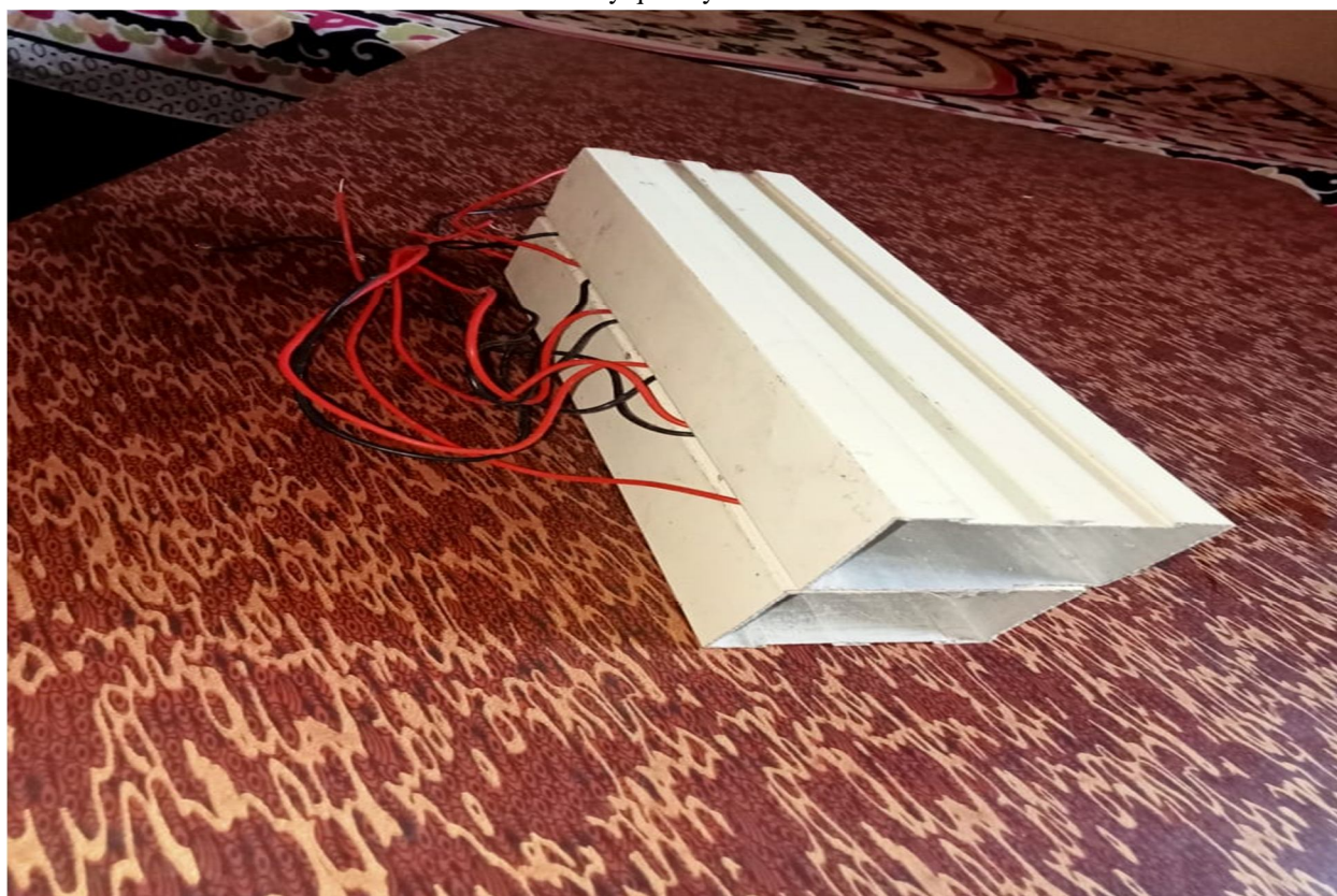
Figure 2. peltier sandwiched between hollow boxes

Another hollow box is placed and pasted on another layer of peltier by using thermal paste as shown in fig. 2. In the hollow boxes we filled a chemical which absorbs heat and also freezes very quickly.