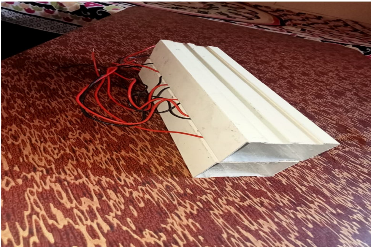
Figure 2. Peltier sandwiched between hollow boxes

Another hollow box is placed and pasted on another layer of Peltier by using thermal paste as shown in Fig. 2. In the hollow boxes we filled a chemical which absorbs heat and also freezes very quickly.