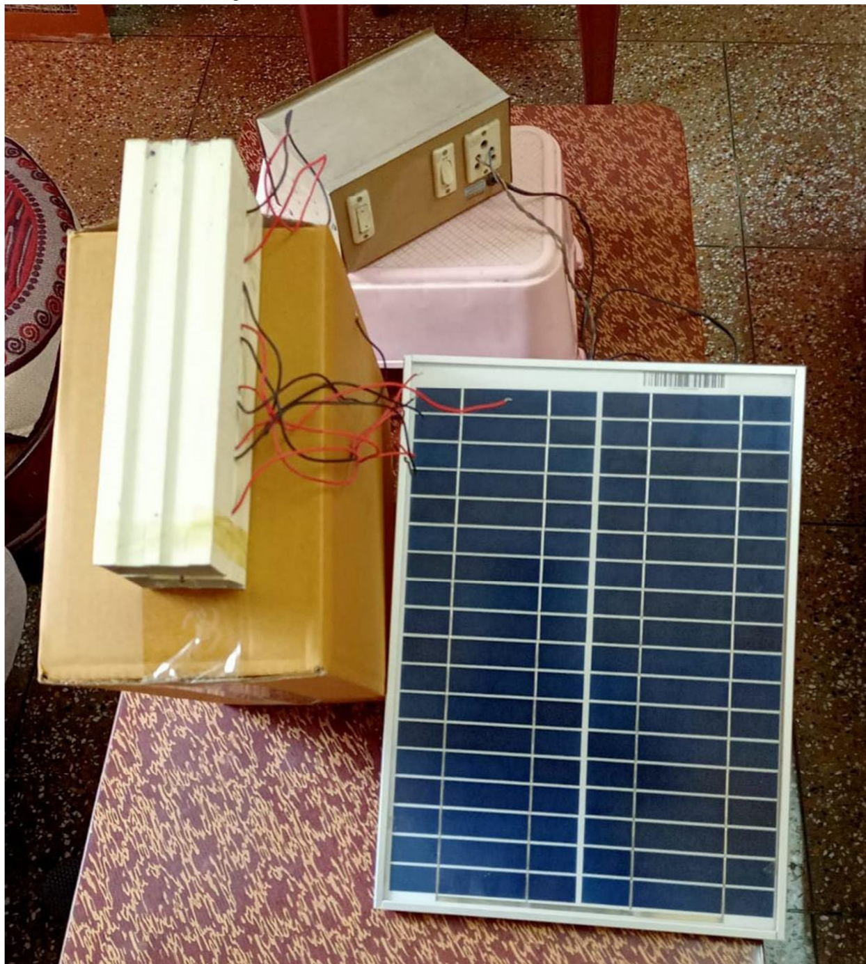
Figure 3. Arrangement Of Solar Panel, Inverter, and Peltier

We have used one solar panel to which generates electricity and this energy is used to run a mechanism which cools the chemical for the peltier. This mechanism is attached to the cold side of peltier modules surface. When there is sunny day the upper part of modules which is facing the sun heats up with the help of hot chemical filled inside the upper box. It transfers heat to the modules. And at the same time the solar panel starts generating electricity and send it to the inverter then inverter converts it in A.C. supply and then it starts cooling generator then it starts cooling the chemical which is filled in the hollow box attached to the cold side of peltier module surfaces as shown in Fig 3.