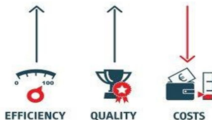
Fig 3: Machine Learning study [3]

As AI or machine learning capabilities grow, a cloud payment system will become more useful, allowing businesses to save money. GPU power can be used without the need for expensive computer hardware. Machine learning in the cloud provides low cost data storage, thus improving system cost efficiency.