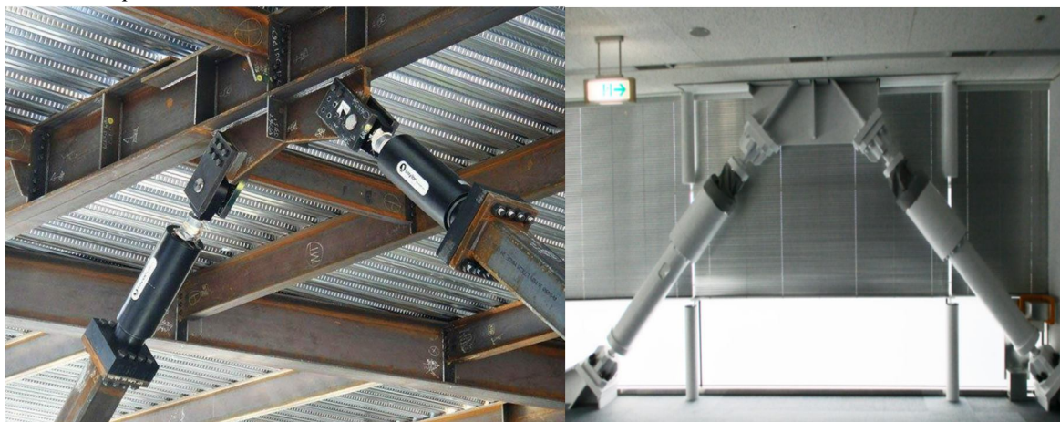
Figure 1.3 Viscous fluid damper