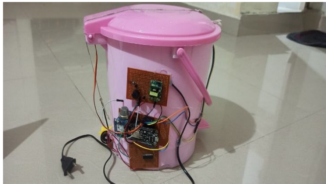
Fig. 1 Hardware Setup

In Hardware Implementation at first, we connect the Node MCU ESP32 to Arduino IDE in which we write the code and it generates the IP address and communicates using TCP/IP using LabVIEW. The below figure gives the idea of the Hardware connection.