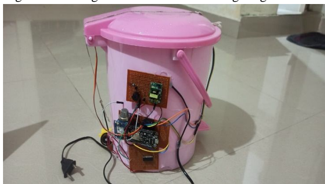
Fig. 1 Hardware Setup

In Hardware Implementation at first, we connect the Node MCU ESP32 to Arduino IDE in which we write the code and it generates the IP address and communicates using TCP/IP using LabVIEW. The below figure gives the idea of the Hardware connection.