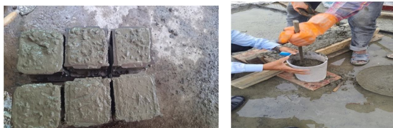
Figure 2: Casting of cubes, beam and cylinder

Here, 27 cubes are put to the test. The compressive strength of the concrete mix is determined for 7 days, 21 days, and 28 days of curing using cubes with dimensions of 150mm x 150mm x 150mm. All of the cubes are put through rigorous testing in accordance with IS criteria and standards. Hand-operated Compression Testing Machine is used for testing (CTM).