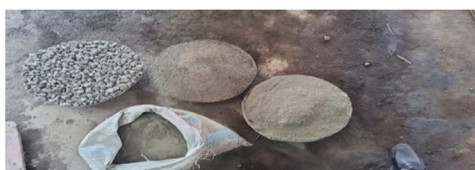
Figure 1: GGBS and Materials

GGBS is sourced from the Bokaro Steel Plant in the Jharkhand district of Bokaro. It has an off-white colour, as depicted in the illustration..