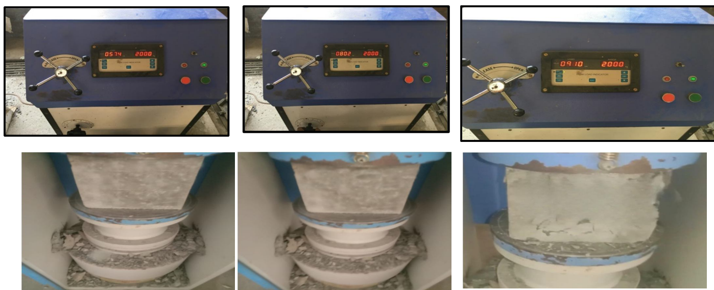
Figure 3: Testing Of Cubes On CTM