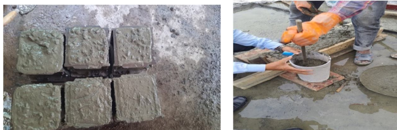
Figure 2: Casting of cubes, beam and cylinder

Here, 27 cubes are put to the test. The compressive strength of the concrete mix is determined for 7 days, 21 days, and 28 days of curing using cubes with dimensions of 150mm x 150mm x 150mm. All of the cubes are put through rigorous testing in accordance with IS criteria and standards. Hand-operated Compression Testing Machine is used for testing (CTM).