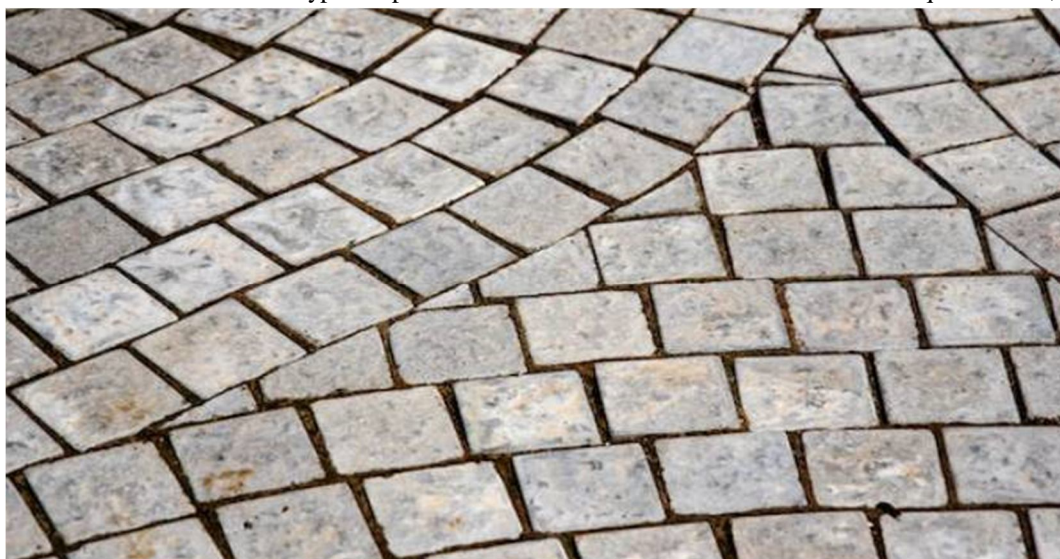
Figure 1.1: Picture Showing Paver Pavement

Over the past decade, the paver block industry has maintained its position as one of the fastest-growing segments in construction technology. In fact, paver blocks have been extensively used in residential and infrastructure projects due to their low maintenance and smooth finish. To know about different types of paver blocks available in the market and their unique benefits, read here.