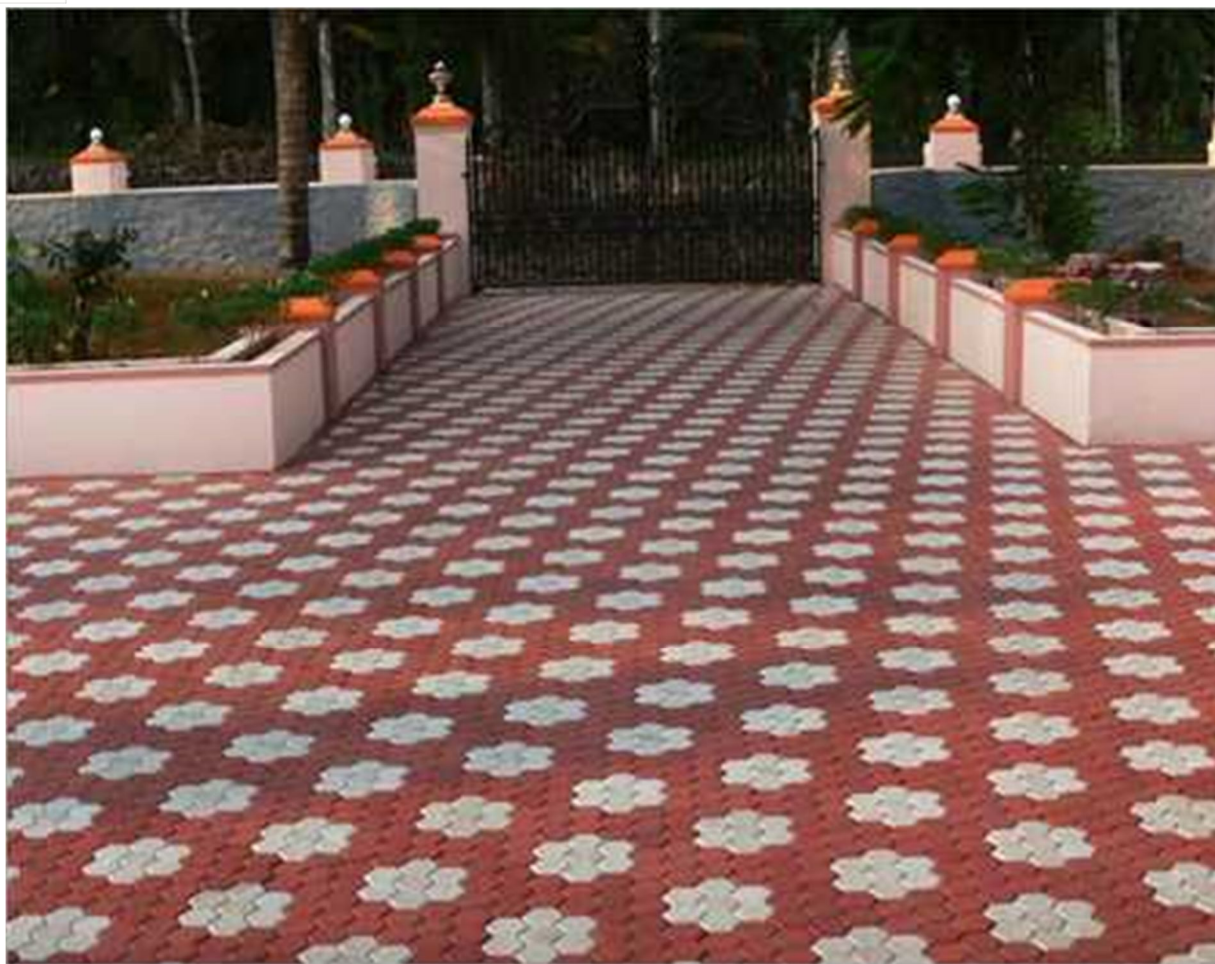
Figure 1.2: Picture Showing Paver Tiles