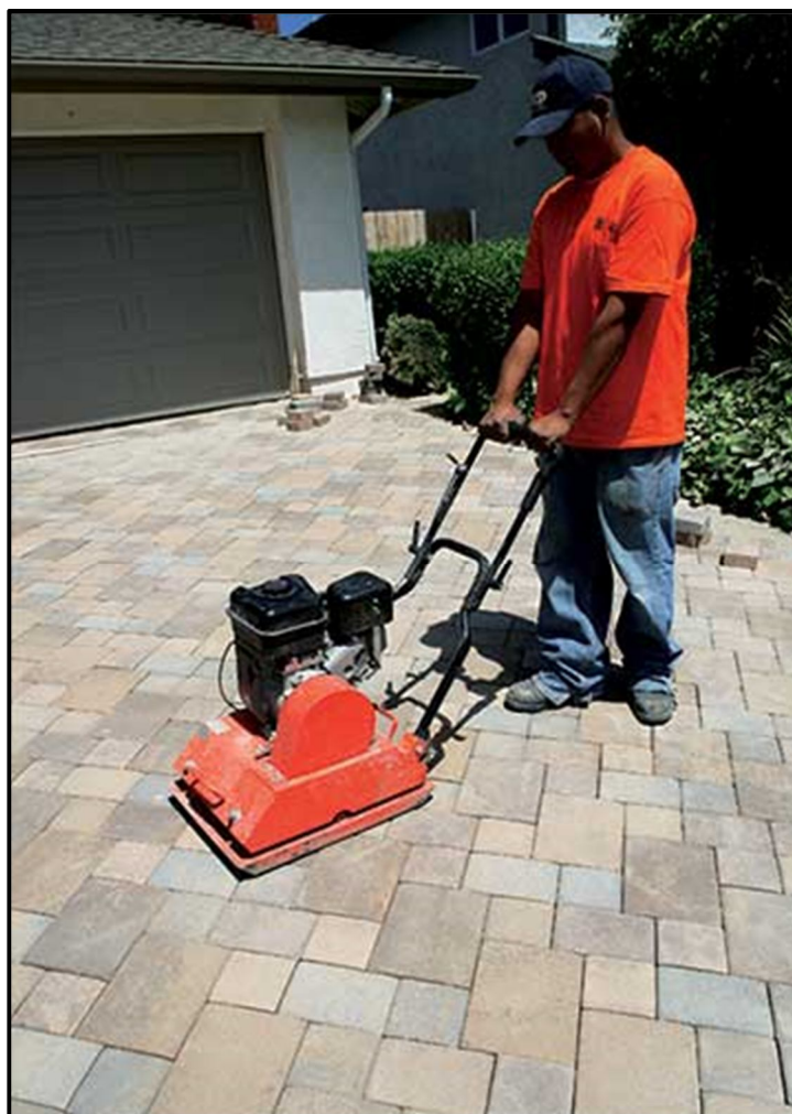
Figure 2.1: Vibration

This single pass will help set the pavers into the bedding sand, and cause some sand to move up between the joints of the pavers. This is the initial stage of the "interlock".