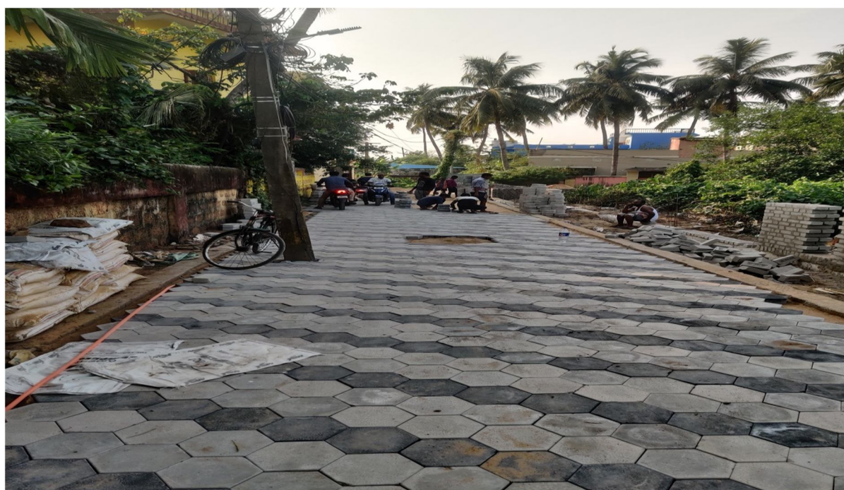
Figure 2.0: Final Cement Concrete Pavement Using Paver Blocks