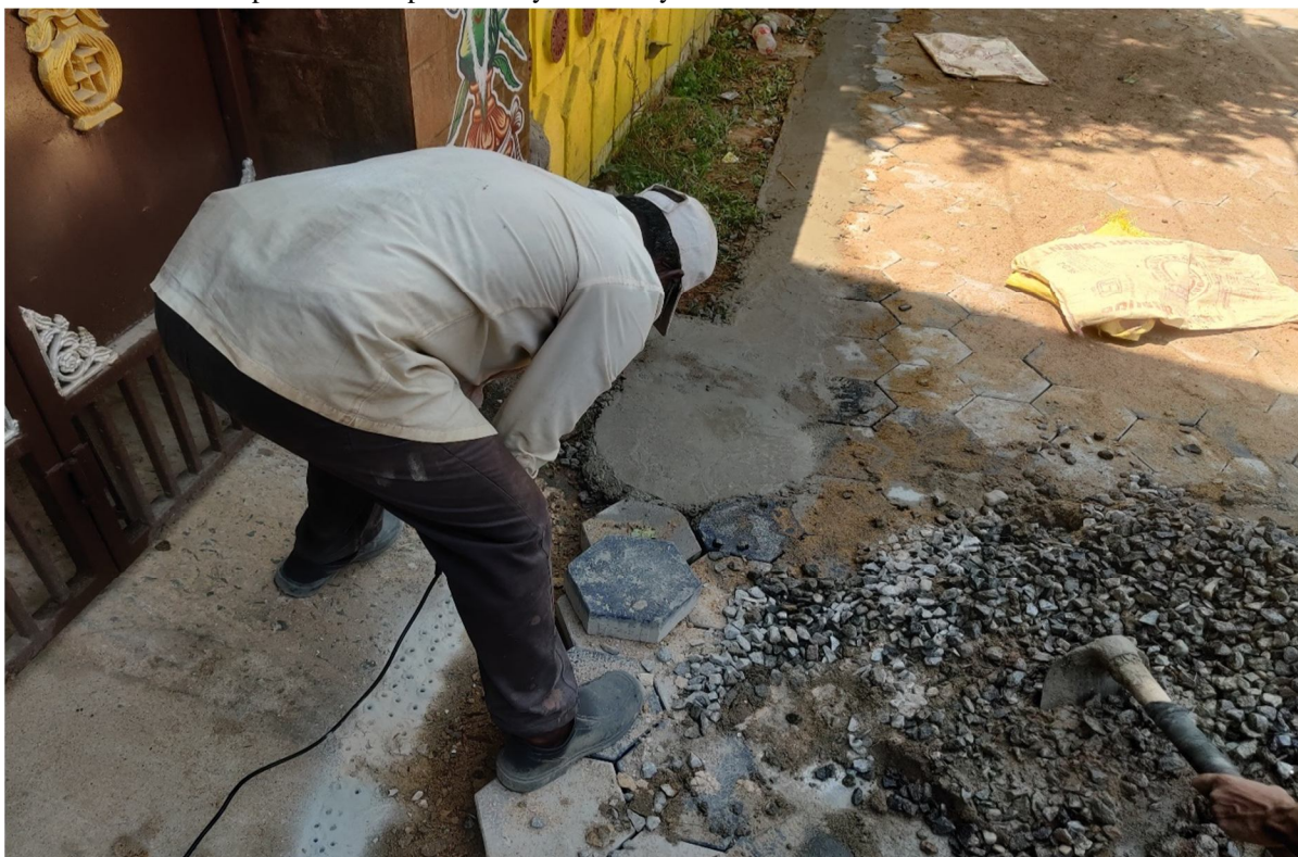
Figure 2.0: Trimming Process

As the field moves closer to the edge restraint or concrete border, cutting may be required to fit the pavers to the desired space. Cutting of pavers should be done with a diamond masonry blade and saw or if needed, it can be accomplished using a block splitter, but a splitter will not allow the precision cut provided by a masonry saw.