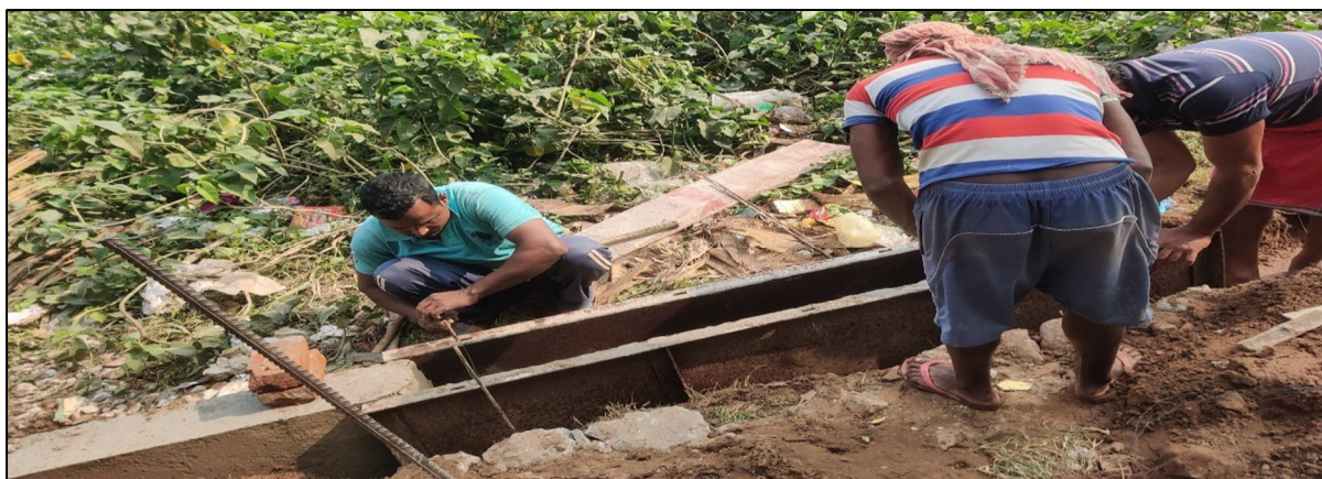
Figure 1.6: Construction of Guard Wall

Clean, sharp concrete sand, 1" deep, should be used for the sand bedding. To determine the amount of sand needed, allow 1 cubic yard of sand per 300sqft. For help estimated the amount of product needed, contact an RCP Block & Brick near you.