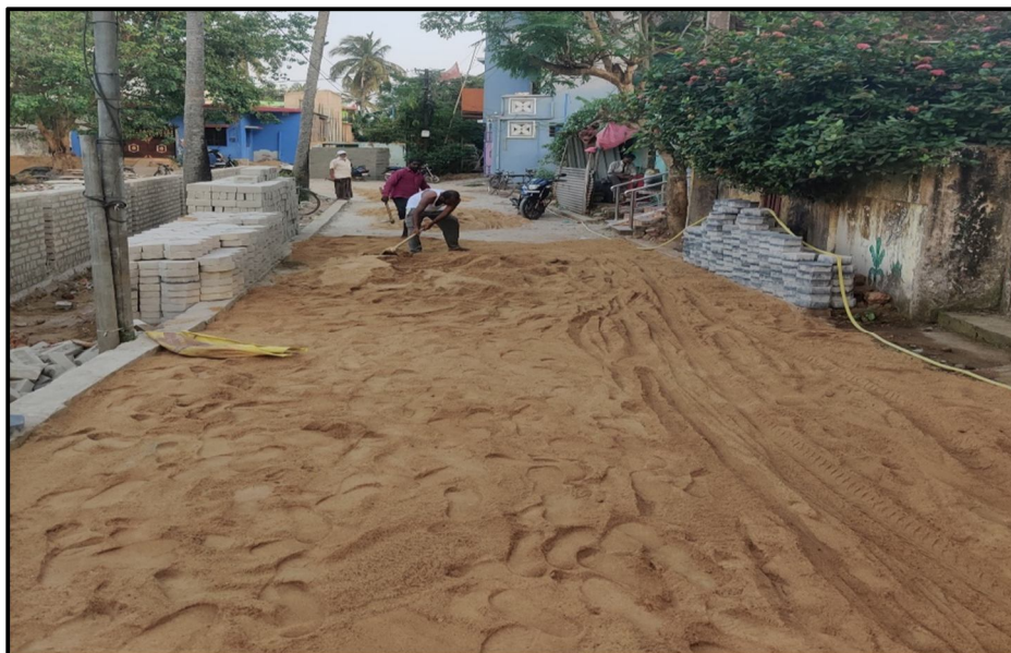
Figure 1.7: Sand Filling Process

TIP: "Screeding" - In order to get a 1" depth of bedding sand, use two pieces of 10' long 3/4" metal pipe (outside diameter will be 1") and a straight wood 2x4. Lay the pipes parallel to each other, directly on the base material, and approximately 6' apart. Loosely spread a layer of bedding sand over these "screed pipe" so that it fills slightly above the top of the pipe. This will avoid compaction before the pavers are laid. Positioning yourself between the pipes. Place a wood 2x4 perpendicular across the screed pipes. Slowly pull the 2x4 towards you while sliding the wood right and left in a repetitive motion. This will help to level the sand more accurately. This process will leave a one inch layer of sand. Remove screeding pipes and fill in void with loose sand. Remove any excess sand.