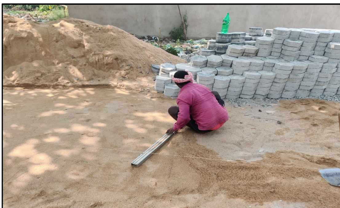
Figure 1.8: Bedding and Sand Levelling

IMPORTANT: Do NOT walk on or disturb screeded sand bed.