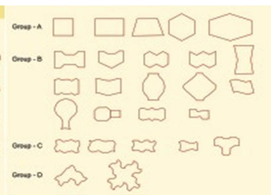
Figure 1.4: Typical Shapes of Pavers

The generic shapes and groups of paver blocks identified to four types are illustrated in Figures 1.3 & 1.4.