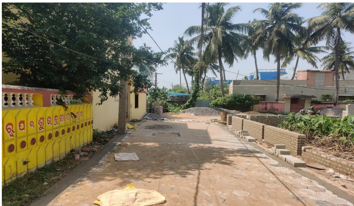
Figure 2.1: Filling The Gaps in between the blocks using sand