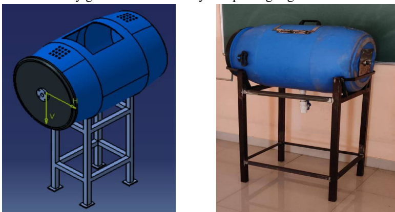
Fig: Wet Waste Composter

Increased trash output, either wet waste or dry waste, has resulted from rising rates of population expansion and industrial development, particularly in urban areas. Realizing a sustainable wet waste management system has proven difficult, particularly in many wealthy countries. Organic garbage makes up a large amount of municipal solid trash in many nations. Around half of it can be composted, according to estimates. Instead, the majority of it is filled with land and burned. We can save resources and develop a useful by-product that can be used as locally generated fertiliser by composting organic waste.