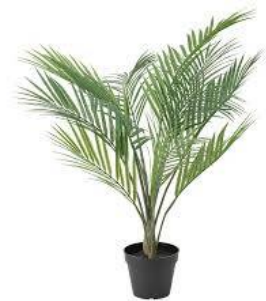
Fig. Areca Palm Tree