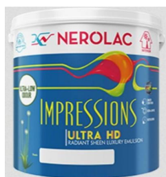
Fig: Nerolac Impression