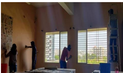
Fig: Before painting