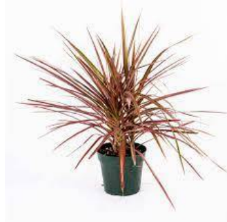
Fig. Red Dracaena