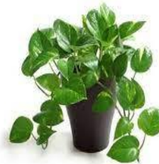
Fig. Money Plant