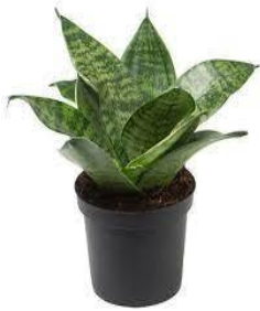
Fig. Snake Plant