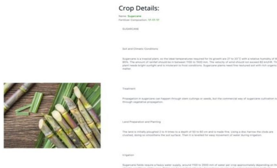
Fig: Crop Details

It Provides information regarding the right fertilizer that is to be used. And also conveys the required data to the farmer using a message service platform.