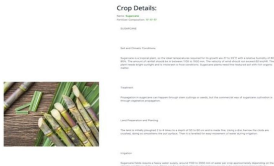
Fig: Crop Details

It Provides information regarding the right fertilizer that is to be used. And also conveys the required data to the farmer using a message service platform.