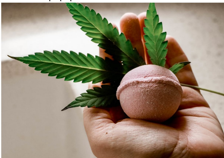
Fig. No. 2 Bath Bomb

Bath bombs have become a popular and beloved self-care product that provides a luxurious and multi-sensory bath experience. When added to bath water, these swollen balls bubble up and release many colours, scents and skin components. Bath bombs have gained widespread popularity for their ability to transform an ordinary bath into a spa-like retreat that relaxes, refreshes and nourishes the skin. Bath bombs can be traced back to late 1980s England, where they quickly gained recognition for their ability to provide a unique and pampering bath experience. Bath bombs usually consist of baking soda, citric acid, and various oils, butters, and plant extracts that contribute to their unique properties.