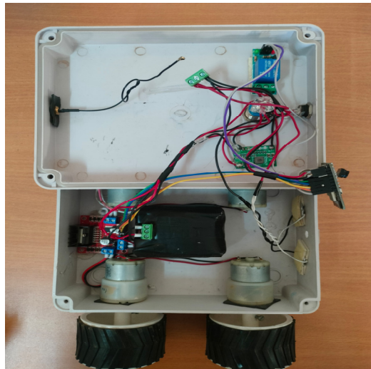
Fig. 1 Fabricated Model

Stability is paramount in the design of the Sewer Inspection Robot, especially considering the challenging environment of Sewer pipelines. The four-wheeled rover configuration, coupled with a sturdy chassis design, enhances the robot's stability, minimizing the risk of tipping or getting stuck during operation.