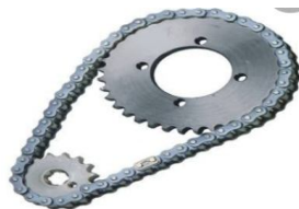
Fig No 3: Sprocket chain

Sprockets are used primarily in chain driven systems to transfer power or rotation to other shafts. The name 'Sprocket' applies generally to any wheel upon which radial projections engage a chain passing over it is distinguished from a gear in that sprockets are never meshed together direct, and different from a pulley in that sprockets have teeth and pulleys are smooth except for timing pulleys used with toothed belts. Sprockets are used in bicycles, motorcycles tracked vehicles, and other machinery either to gears are unsuitable or to impart linear motion to track, tape etc.