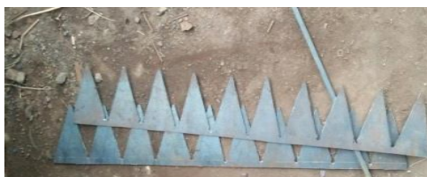
Fig No 4: Cutter Blade

A rotary blade cutter is used for quick cuts, a tangential knife for details and a creasing tool for setting fold lines. Cutter is made up of high speed steel it has high hardness and stiffness it have great capacity to cut the crop. Cutting systems are used to work with corrugated cardboard, composites, rubber, cork and filter materials. The thickness of cutter is 4 mm. The angle between two teeth is 45°. Cutters used for harvesting, or reaping, grain crops or cutting succulent forage chiefly for feeding livestock, either freshly cut. Cutting heads include circular saw blades, brush knives, grass blades, etc.