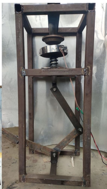
Fig. 5: Front view of the machine Fig.6: Top view of the machine Fig. 7: Side view of the machine