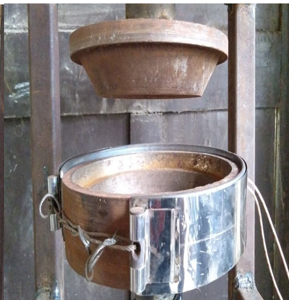
Fig.2: Upper die, lower die and heater