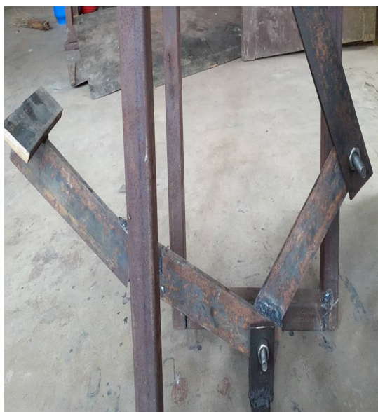
Fig.1: Foot Pedal