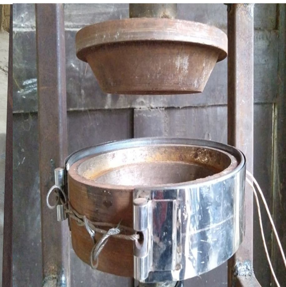
Fig.2: Upper die, lower die and heater