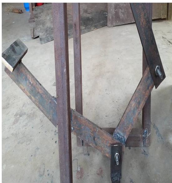
Fig.1: Foot Pedal