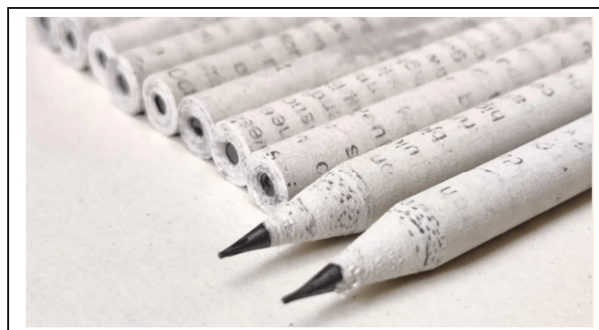
Fig. 1. Paper Pencil

The goal of this research is to apply precision control mechanisms to modify the drying stage of the manufacture of paper pencils, thereby decreasing common issues such as uneven drying, distortion, and inefficient use of resources. Modern technology is incorporated into the recommended drying machine to regulate important parameters like temperature, humidity, and airflow, ensuring optimal drying conditions. The system's transformative potential is demonstrated by the statistical data gathered from the experimental trials. According to preliminary findings, it is possible to considerably reduce drying time without sacrificing production output or product quality.