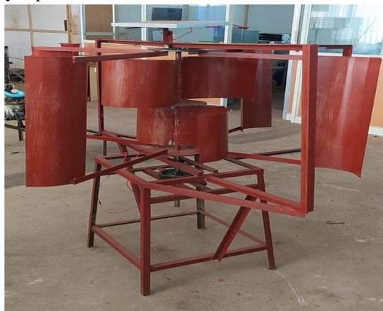
Figure3: Original model

In order to reduce friction and minimize power loss in machines and instruments, ball bearings are extensively employed. Although the idea of ball bearings can be traced back to the time of Leonardo da Vinci, their design and manufacturing process has evolved significantly, and has become exceedingly sophisticated.