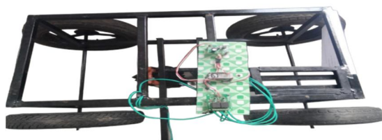
Fig 4 Fabrication of IOT operated cono weeder