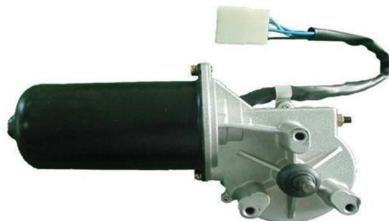
Fig.2 DC motor

A DC motor is any of a class of rotary electrical machines that converts direct current electrical energy into mechanical energy. The most common types rely on the forces produced by magnetic fields. Nearly all types of DC motors have some internal mechanism, either electromechanical or electronic; to periodically change the direction of current flow in part of the motor. Different number of stator and armature fields as well as how they are connected provides different inherent speed/torque regulation characteristics. The speed of a DC motor can be controlled by changing the voltage applied to the armature. The introduction of variable resistance in the armature circuit or field circuit allowed speed control. Modern DC motors are often controlled by power electronics systems which adjust the voltage by "chopping" the DC current into on and off cycles which have an effective lower voltage.