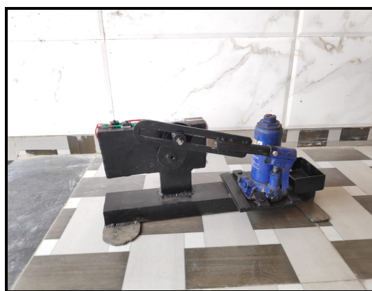
Fig 1. Motorized Hydraulic Jack system (3 rd view and 4 th view)