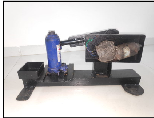
Fig 1. Motorized Hydraulic Jack system (1 st view and 2 nd view)