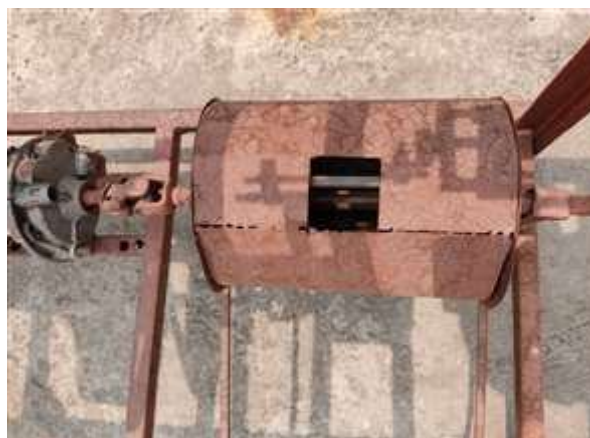
Figure :- Groundnut Stripper