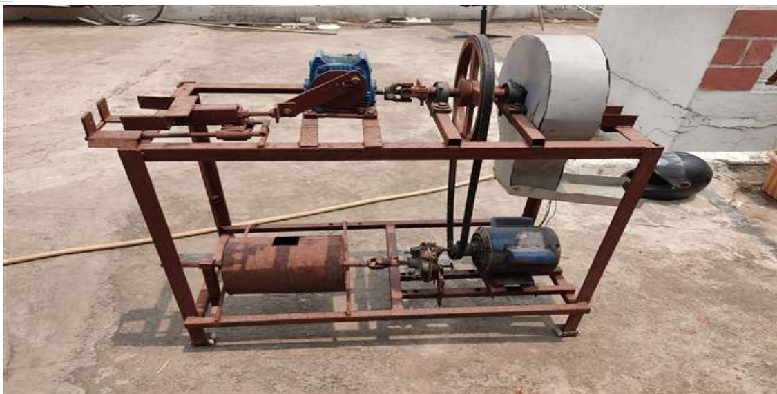
Figure :- Actual Machine