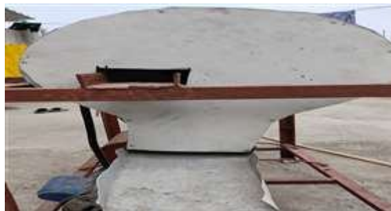
Figure :- Straw Cutter