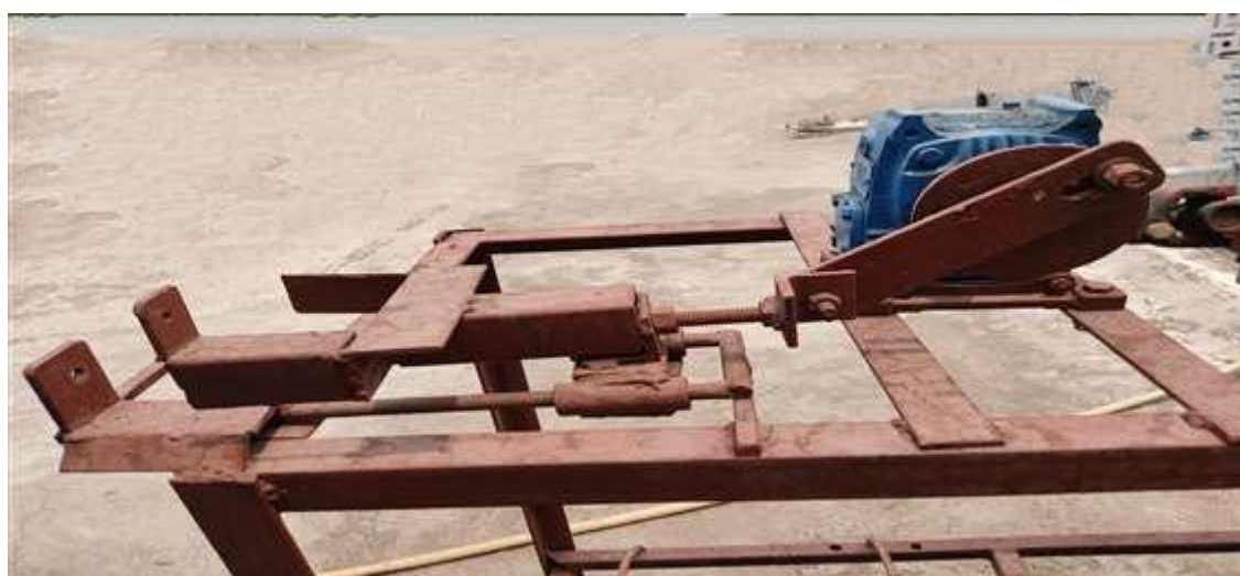
Figure :- Sugarcane Seed Cutting