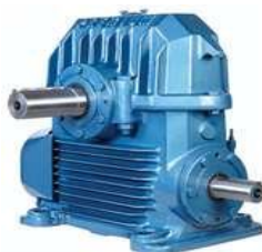
Gear ratio 1:30.