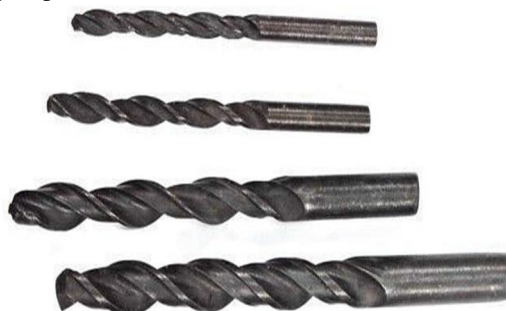
Fig 1: Drill bits