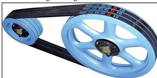
Fig. 5 Belt and pulley