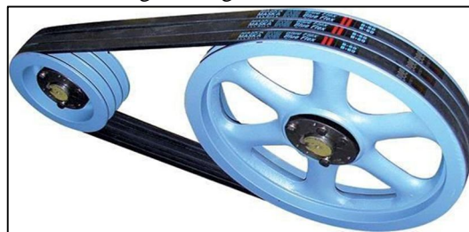
Fig. 5 Belt and pulley