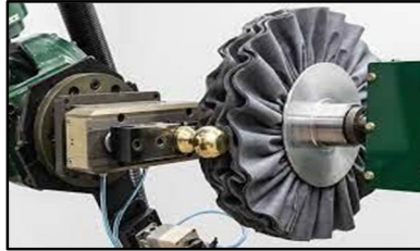
Fig. 7 Buffing wheel.

9) Buffing: Buffing is defined as a finishing process that involves the use of a loose abrasive on a wheel. To polish a work piece, a manufacturing company may use a wheel that's covered with an abrasive disc. Generally, the wheels used in the buffing process are made up of cloth or the fiber which is charged with loose abrasive grains. The buffing belts are made in the same way as wheels. A very fine abrasive is used for being charged to these wheels or belts and charging is generally done by using sticks made up of abrasive or/and wax.