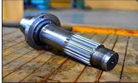
Fig. 4 Shaft