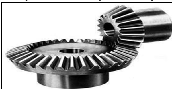
Fig. 6 Gears.