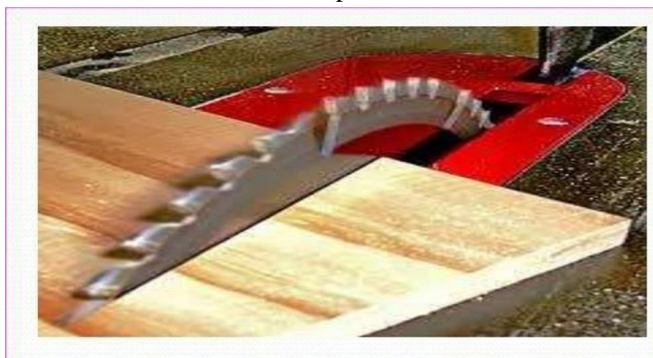
Fig 2 cutting