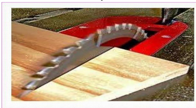
Fig 2 cutting