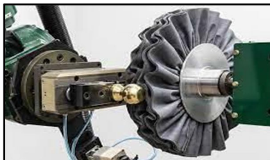
Fig. 7 Buffing wheel.