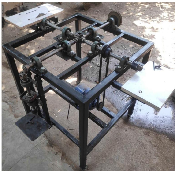
Fig. 9 Final Design of Multipurpose Mechanical Machine.