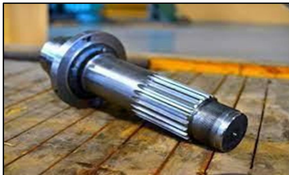
Fig. 4 Shaft