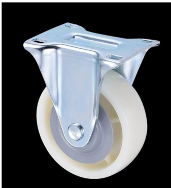
Material :Nylon Wheel includes 4 piece swivel and 4 fix caster wheel Rotate 360°

The wheels made of the popular Non-marking nylon type absorbs shock and vibrations .Ideal as replacement castors for office chairs,Sofa,cabinets ,coffee table ,plant stands, tables ,house hold furniture ,washing machine stands ect