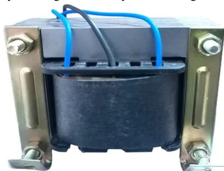
Input voltage -230volt Output voltage-15volt

Step down transformer are used to decrease the voltage incoming to the site by increasing the electrical current It dose this by converting the incoming voltage in the primary winding to necessary lower voltage in the secondary winding.