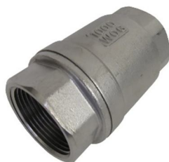
1 1/2 inch cast iron (NRV)

The Non-return valves are used to ensure the right direction of the flows of the medium through a pipe, as pressure conditions may otherwise cause reversed flow.