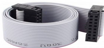
Female to female Material : Plastic

Jumper wires are electrical wires with connector pins at each end. They are used to connect two points in a circuit without soldering