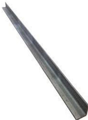
Size – 25x 25(mm x mm)Thickness -3.0mm

Mild steel has high strength and resistance for breakage. It has good mechanical properties which is useful for many engineering applications.