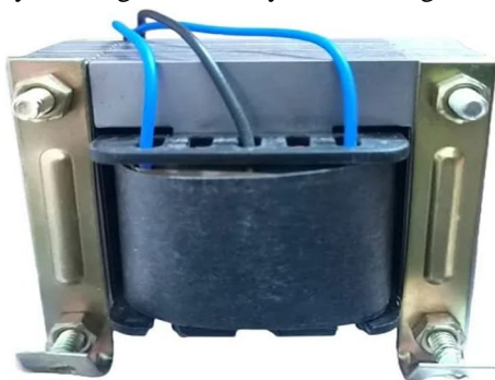
Input voltage -230volt Output voltage-15volt

Step down transformer are used to decrease the voltage incoming to the site by increasing the electrical current It dose this by converting the incoming voltage in the primary winding to necessary lower voltage in the secondary winding.