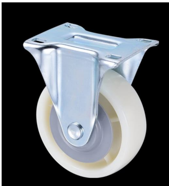
Material :Nylon Wheel includes 4 piece swivel and 4 fix caster wheel Rotate 360°

The wheels made of the popular Non-marking nylon type absorbs shock and vibrations .Ideal as replacement castors for office chairs,Sofa,cabinets ,coffee table ,plant stands, tables ,house hold furniture ,washing machine stands ect