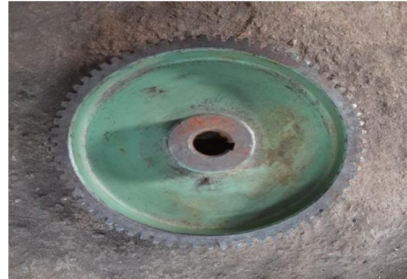
Fig. 3 Spur Gear Wheel