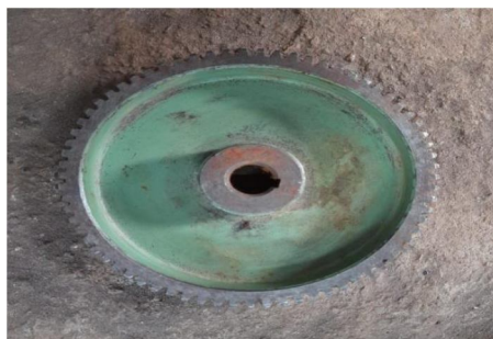
Fig. 3 Spur Gear Wheel