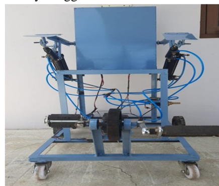
Fig. 5 Prototype model

The power from the DC motor is transmitted to the pedals through a set of spur gears. The spur gears are used to increase or decrease the rotational speed of the motor. The stroke patients are made to sit on the chair and the hands and the legs of the patients are made to rest on the arms and the pedal of the chair respectively. Then the compressed air from the compressor is made to reach the solenoid valve. The solenoid valve is actuated by a toggle switch.