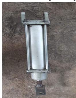
Fig. 2 Pneumatic Cylinder

Pneumatic cylinders are mechanical devices which use the ability of propellant to supply a force in an exceedingly reciprocating linear motion. Like hydraulic cylinders, something forces a piston to manoeuvre within the desired direction. The piston may be a disc or cylinder, and therefore the connecting rod transfers the force it develops to the thing to be moved. Engineers sometimes like better to use pneumatics because they're quieter, cleaner, and don't require large amounts of space for fluid storage.