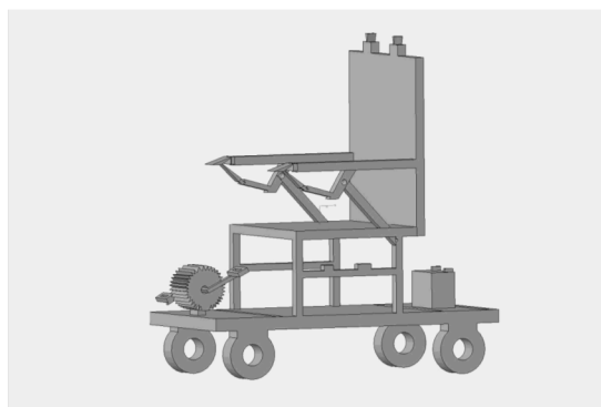
Fig. 4 Model Diagram

The experimental setup of the project consists of a chair setup in which the arms of the chair are fixed to it by suitable joints so that the arms can be moved independently. The leg part of the chair consists of pedal. The pedals are actuated by a DC motor operated by a battery.