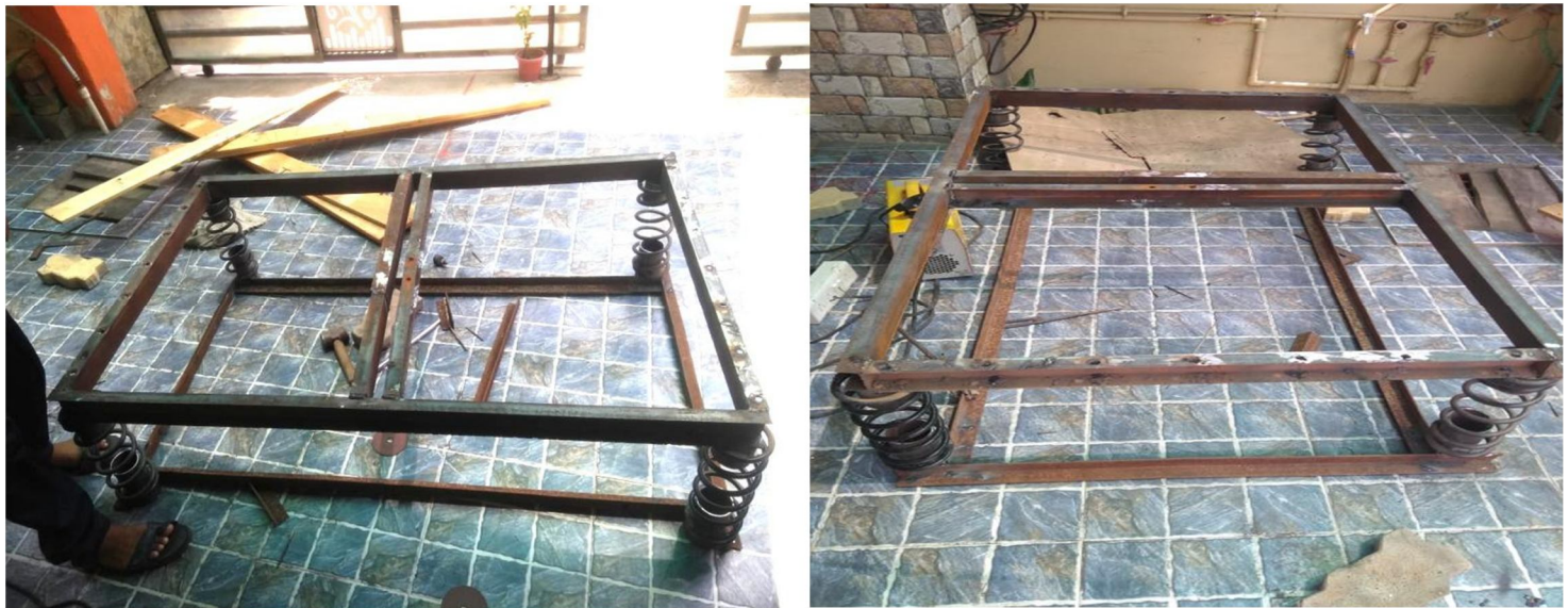
Fig .1.1 Open Vibrating table