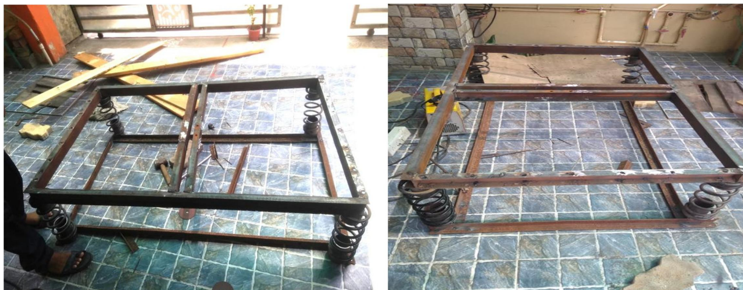
Fig .1.1 Open Vibrating table