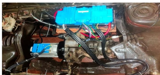
Figure 2. Motor and Gear Box Arrangement

As we are merely using the car's current gear box, the design is not overly complicated.