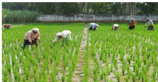
Fig 1: Picture of Manual Weeding Method