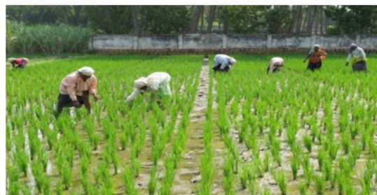
Fig 1: Picture of Manual Weeding Method