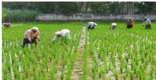
Fig 1: Picture of Manual Weeding Method