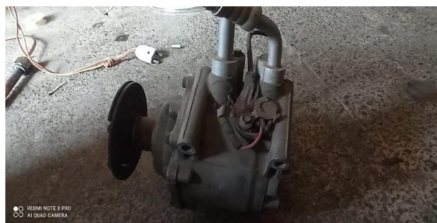
Figure 5: SCROLL EXPANDER