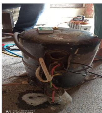
Figure 6: HERMETIC COMPRESSOR