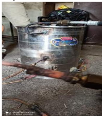
Figure 2: Evaporator

Evaporator is a device used to convert Refrigerant to vapour form. In our project the Refrigerant comes into evaporator. Evaporator is provided by an electric Heater which is working on base of electricity. This heater heats the refrigerant by giving heat. After heating the refrigerant, it goes to centrifugal Compressor.