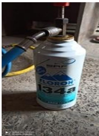
Figure 3: REFRIGERANT

The Aim to use the Refrigerant at the place of water is the low boiling Temperature. Here we have use refrigerant 134a because it is an ecofriendly refrigerant. By this the pollution will be negligible during generation of electricity. It has generally 70 to 90 degree Celsius temperature of boiling.