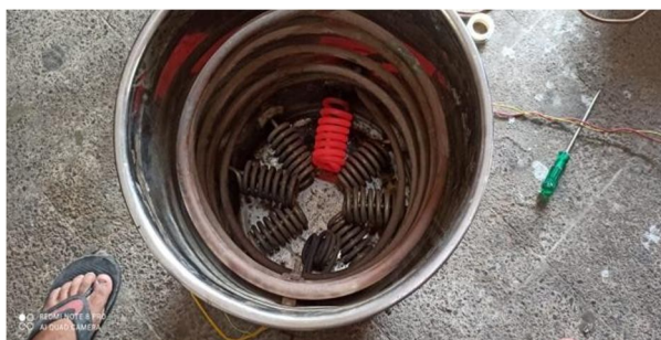
Figure 4: TOP VIEW OF EVAPORATOR