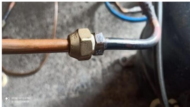
Figure 7: COPPER JOINT