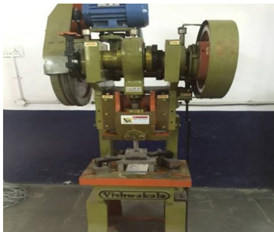
Fig. 1 Press Machine (Mechanical Type)