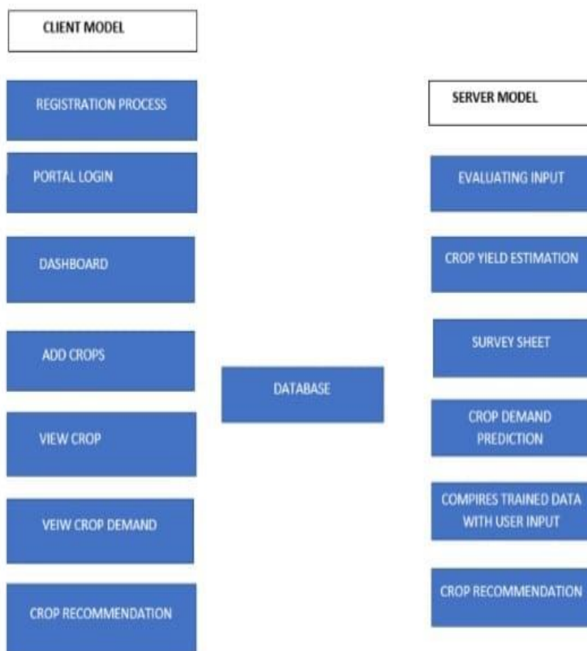
Fig. 2: proposed methodology

It is possible to download this decision-making model for Android. Farmers enter their username, phone number, and password while registering for the application. They will then enter their login information, upload crop information, and have this app download the farmer's current location. This will allow them to check other farmers' crop information and determine whether a market exists for the product they have just launched. they develop, have the ability to choose whether or not to plant crops, and can use the crop recommendations model by supplying information about agricultural land.