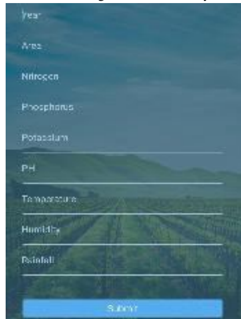
Fig. 8: crop Recommendation

By specifying the sort of crop and the location where it will be grown, the user may determine whether or not the crop is in demand.