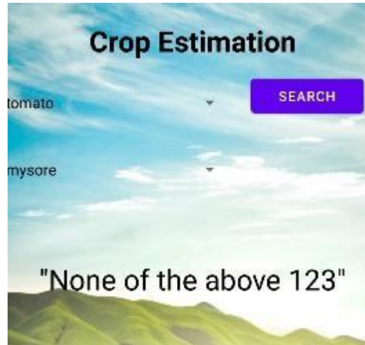
Fig. 7: crop demand estimation

By specifying the sort of crop and the location where it will be grown, the user may determine whether or not the crop is in demand.