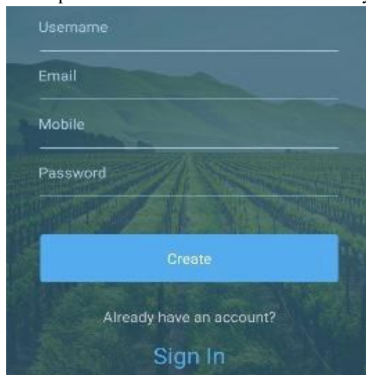
Fig. 4: registration page

The android-based decision-making model was created to support farmers by giving them accurate and complete information on which crops are in demand and which should be planted on their land based on soil fertility.