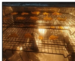
Figure 5 Dehydration of Apple