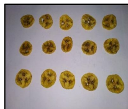
Figure 7 Dehydration of Banana Figure 8 Dehydrated Banana