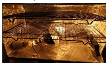
Figure 2 Food Dehydrator Developed by us at GIFT Campus