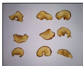
Figure 6 Dehydrated Apple