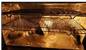
Figure 2 Food Dehydrator Developed by us at GIFT Campus