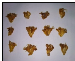
Figure 9 Dehydration of Pineapple Figure 10 Dehydrated Pineapple