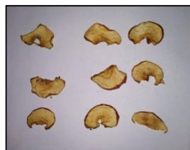
Figure 6 Dehydrated Apple