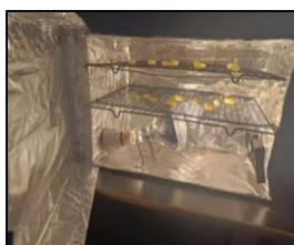
Figure 3 Dehydration of Grapes