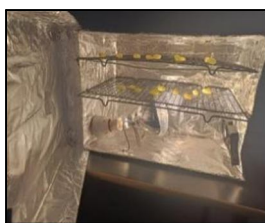
Figure 3 Dehydration of Grapes