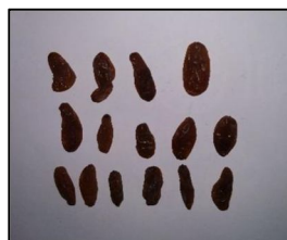
Figure 4 Dehydrated Grapes