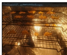
Figure 5 Dehydration of Apple