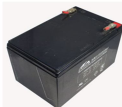
Fig.4: 12V Battery

In order to store the electricity generated by solar and wind energy, batteries are employed. The size of the solar or wind power plant may have an impact on the battery's capacity. Low charge leakage and low maintenance should be characteristics of the battery. The optimum option is the free discharge kind when all these factors are taken into account. Depending on the output from the hybrid systems, multiple batteries can be linked in both series and parallel to enhance or decrease the battery's capacity.