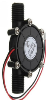
Fig.7: Micro Hydro Power Generator (12V 10W)

A micro hydropower system needs a turbine, pump, or waterwheel to transform the energy of flowing water into rotational energy, which is converted into electricity.