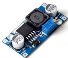
Fig.5: DC to DC Boost Converter

A boost converter, also known as a step-up converter, is a DC-to-DC power converter that increases voltage from its input (supply) to its output (load) while reducing current. This type of switched-mode power supply (SMPS) has at least two semiconductors (a diode and a transistor) and at least one energy storage component, such as a capacitor, inductor, or both. Filters built of capacitors are typically added to such a converter's input (supply-side filter) and output (load-side filter) in order to eliminate voltage ripple.