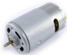
Fig.2: DC Generator

The most effective way to utilize the mechanical energy generated by a pico-hydro system is by powering a DC generator with a powerful magnet. High currents could be provided by a DC generator even at the lowest voltage needed for battery replacement and the operation of direct current loads. They are also significantly less expensive and smaller in size. Since no power is lost creating the magnetic field, this sort of generator is said to be more efficient.