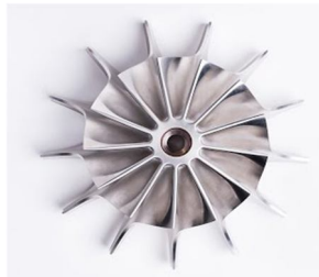
Fig.3: Hydro Turbine Module

A water turbine spins around and uses the energy from moving water to do work. When water flows onto the turbine's blades, it pushes them, making the turbine rotate. This lets the turbine take the energy from the water flow and use it to do mechanical work.