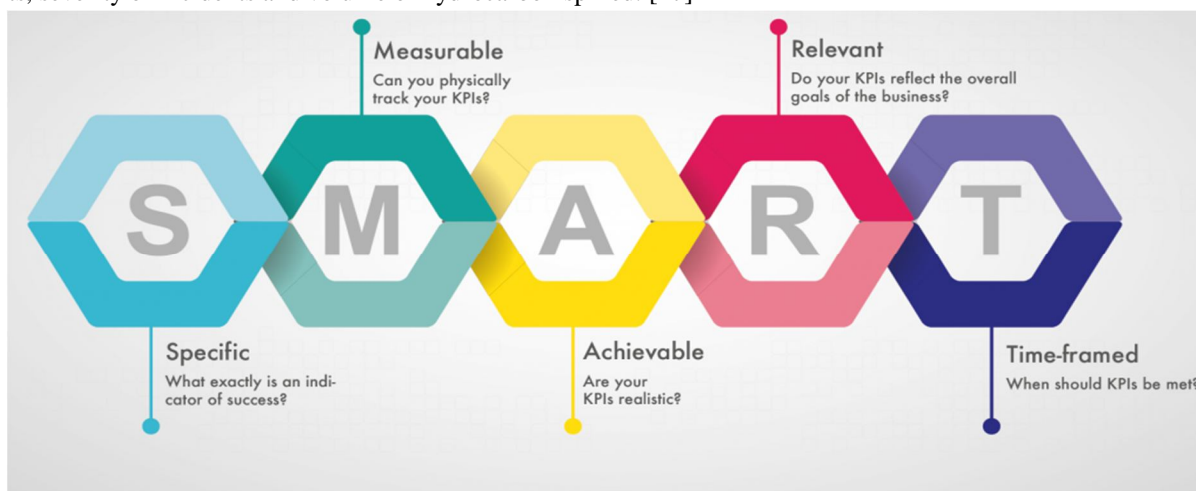
Fig 2. Showing the prerequisite for KPI's using the smart technique [18]

KPI's are broadly used as performance measurement against targets, these targets may be procedural, regulatory or operational performance related. KPI's can also be referred to as assessable measurements which shows the critical achievement factor of a scheme or a project. The most significant prerequisite for a KPI is that they must be S.M.A.R.T, as explained in Fig.2 of this paper, there must also be records of the measurement methodology. The most common pipeline related key performance indicators are, no of incidents, severity of incidents and volume of hydrocarbon spilled. [17]