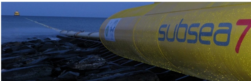
Fig. 1 Showing subsea export pipelines [6]

The majority of the ageing oil and gas pipelines are made up of carbon steel, these pipelines were lowered to the sea bed based on already established standards and practices. DNV-RP-F116 recommends that an export pipeline which is of a high integrity must be able to overcome all impacted loads and remain functional throughout its operational life for as long as they are well inspected and maintained [1].