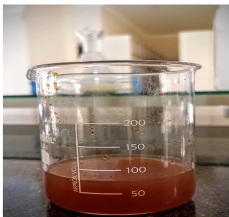
Fig. Aloe vera and pomegranate juice “pomalo”