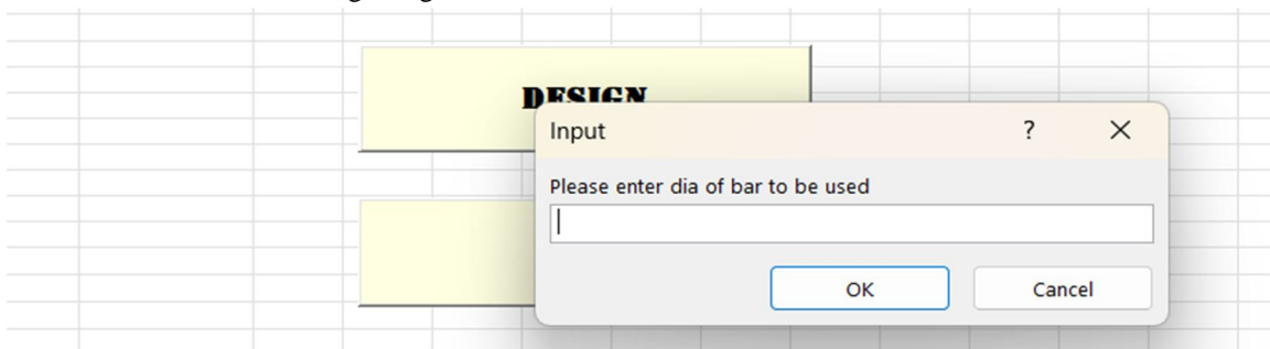
Fig.5: Snapshot of msg box for bar diameter