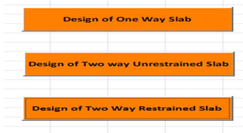
Fig.1: Snapshot of Main Menu of Design Tool

The developed Design Spreadsheet contains three modules excluding Main Menu, which let the user simply toggle between different modules, by just clicking the respected button.