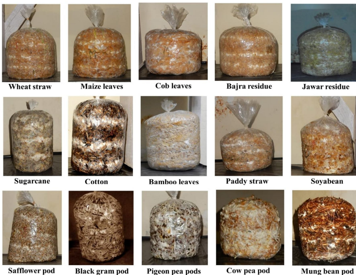
Photo plate no.2. Effect of different substrates on mycelial growth