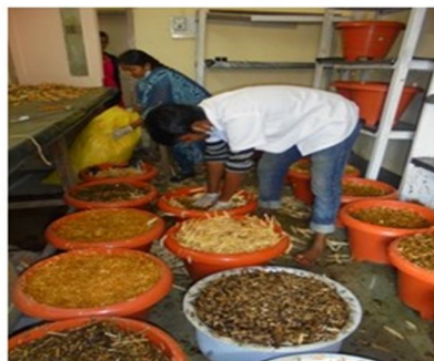
Sterilization of substrates