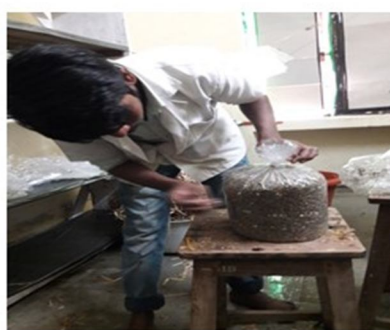
Layer spawning Bed and Pining